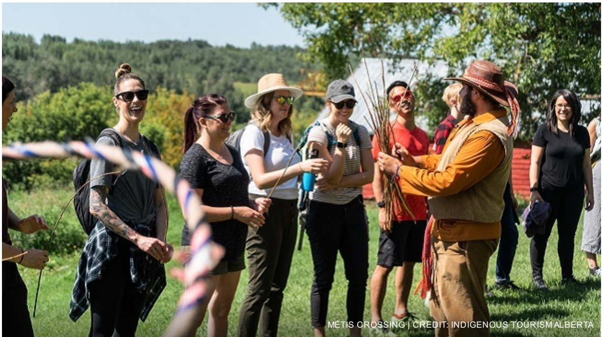
MÉTIS CROSSING