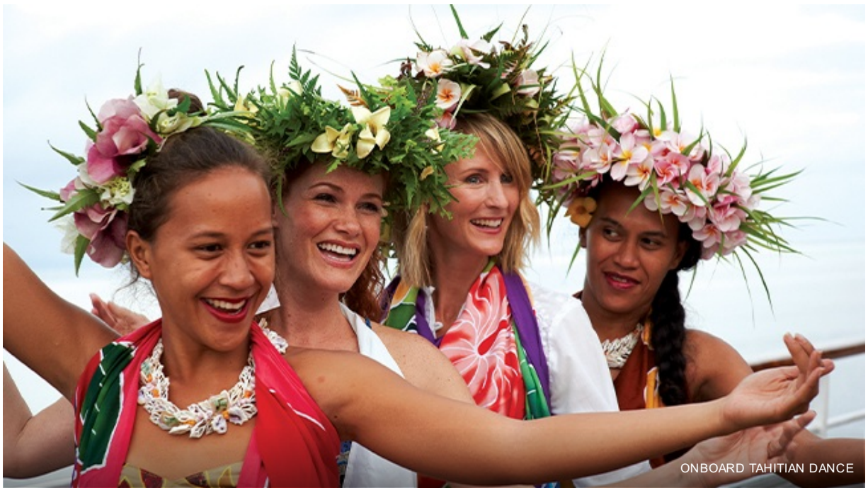
ONBOARD TAHITIAN DANCE