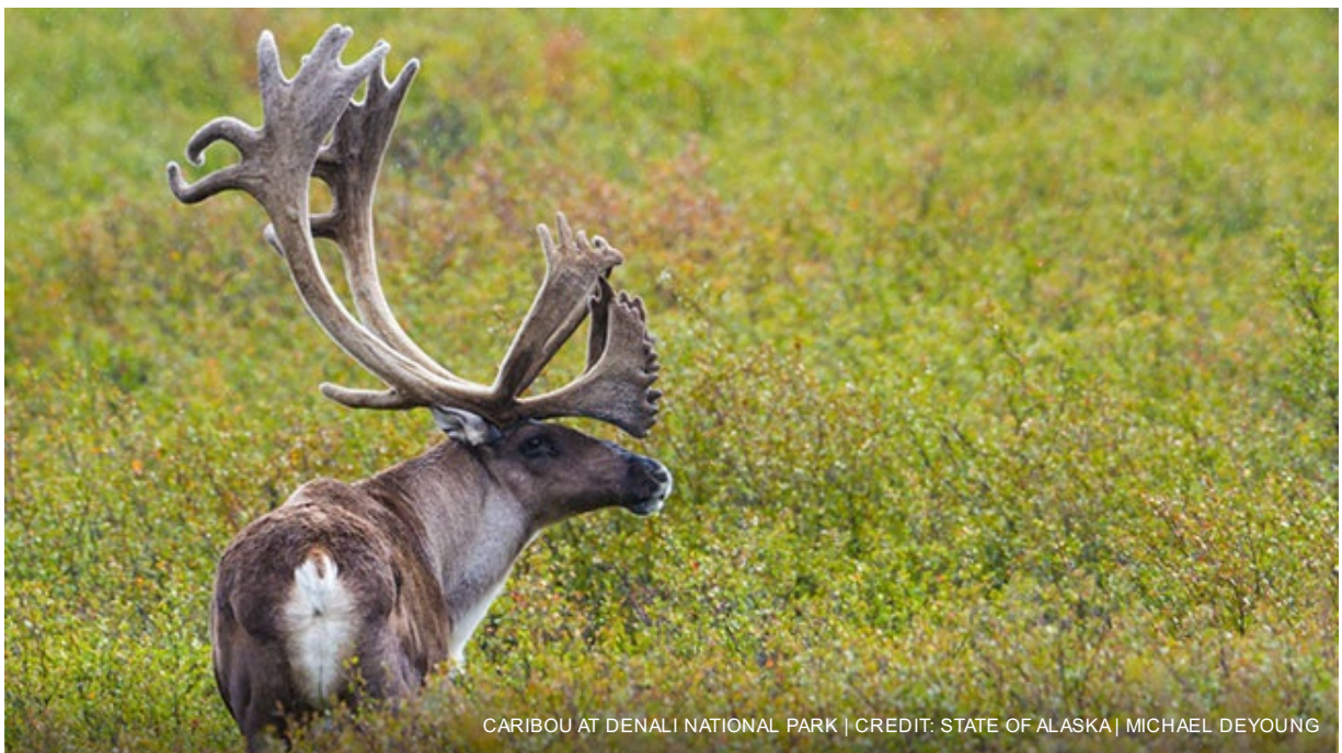
CARIBOU AT DENALI NATIONAL PARK