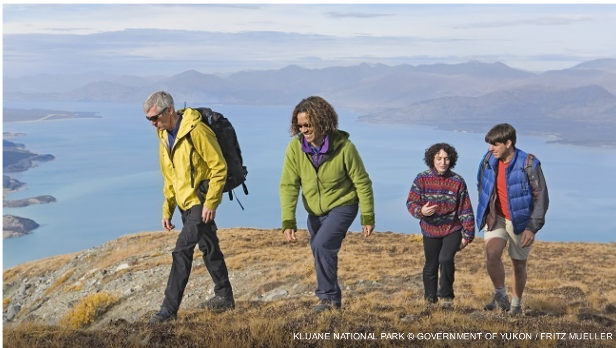
KLUANE NATIONAL PARK