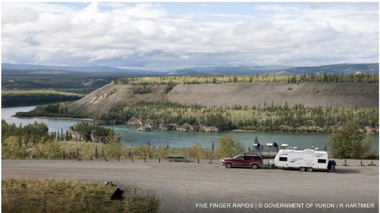
FIVE FINGER RAPIDS