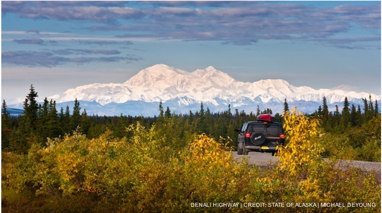
DENALI HIGHWAY