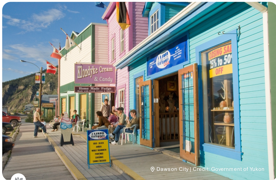
Dawson City