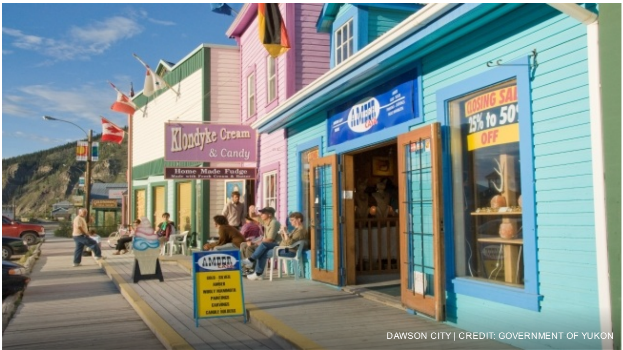
DAWSON CITY