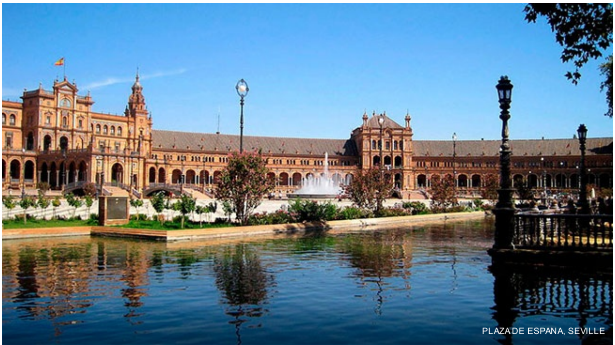
PLAZADE ESPANA, SEVILLE