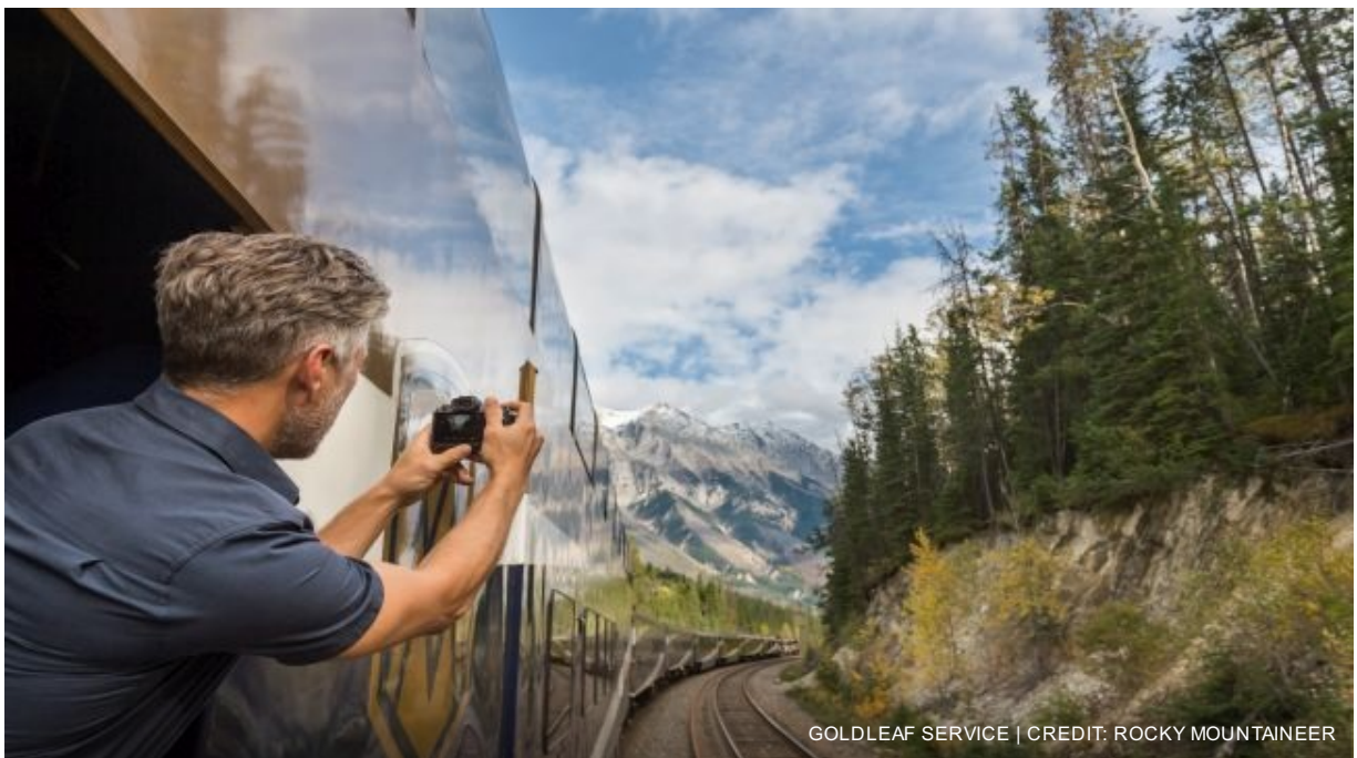
GOLDLEAF SERVICE