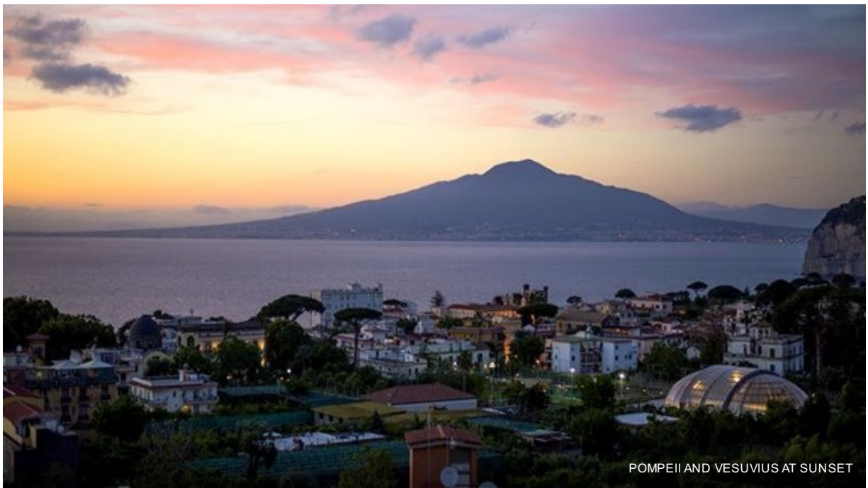
POMPEII AND VESUVIUS AT SUNSET