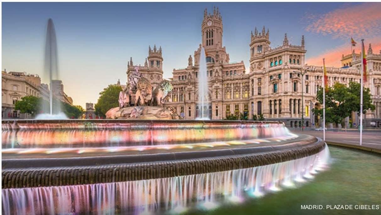
MADRID. PLAZA DE CIBELES