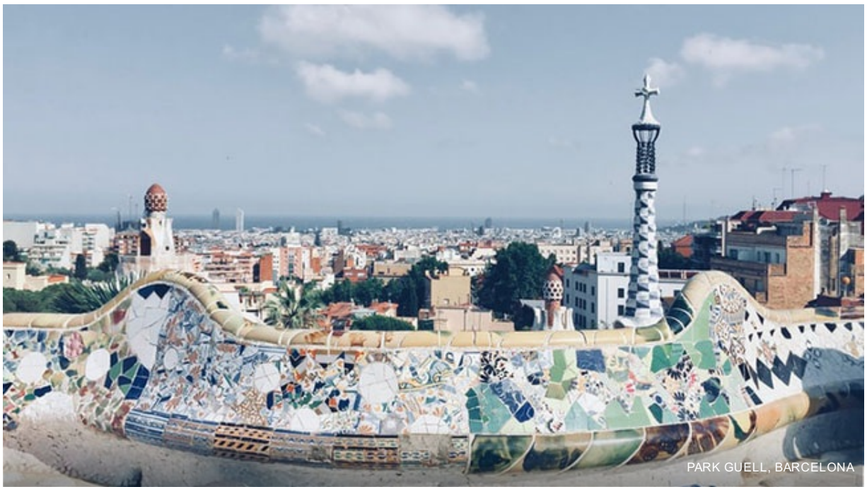
PARK GUELL, BARCELONA