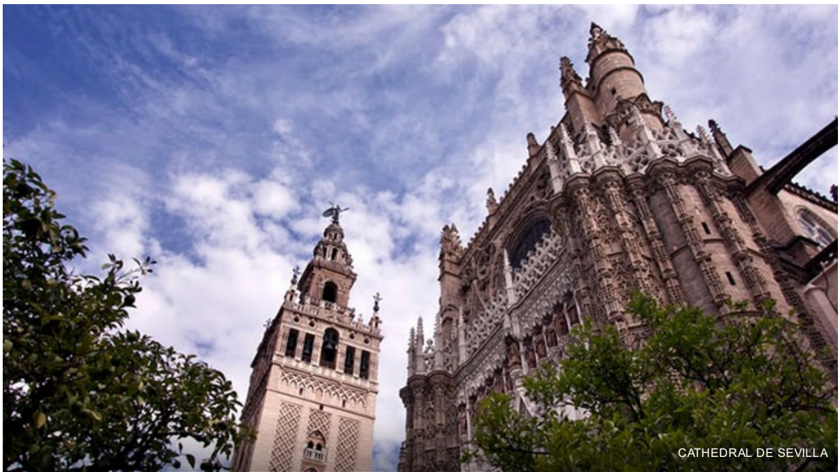
CATHEDRAL DE SEVILLA