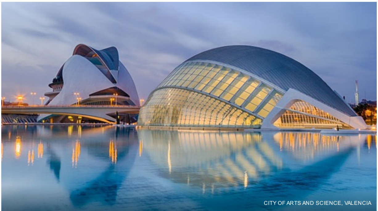
CITY OF ARTS AND SCIENCE, VALENCIA