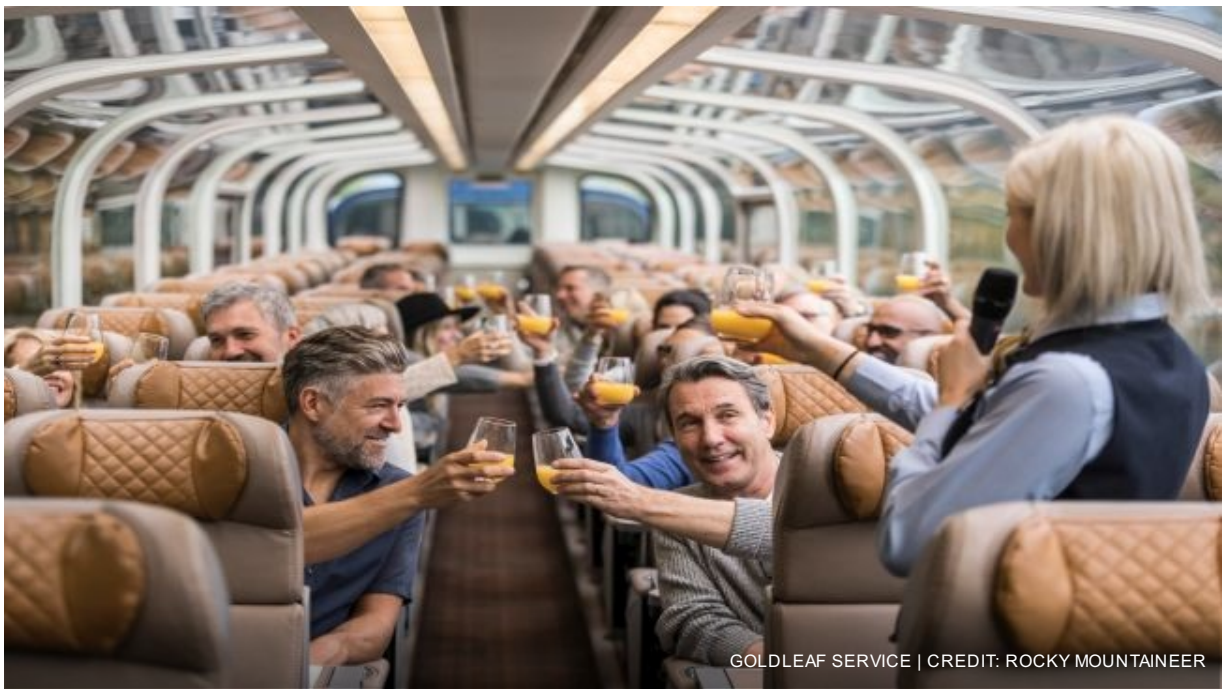
GOLDLEAF SERVICE