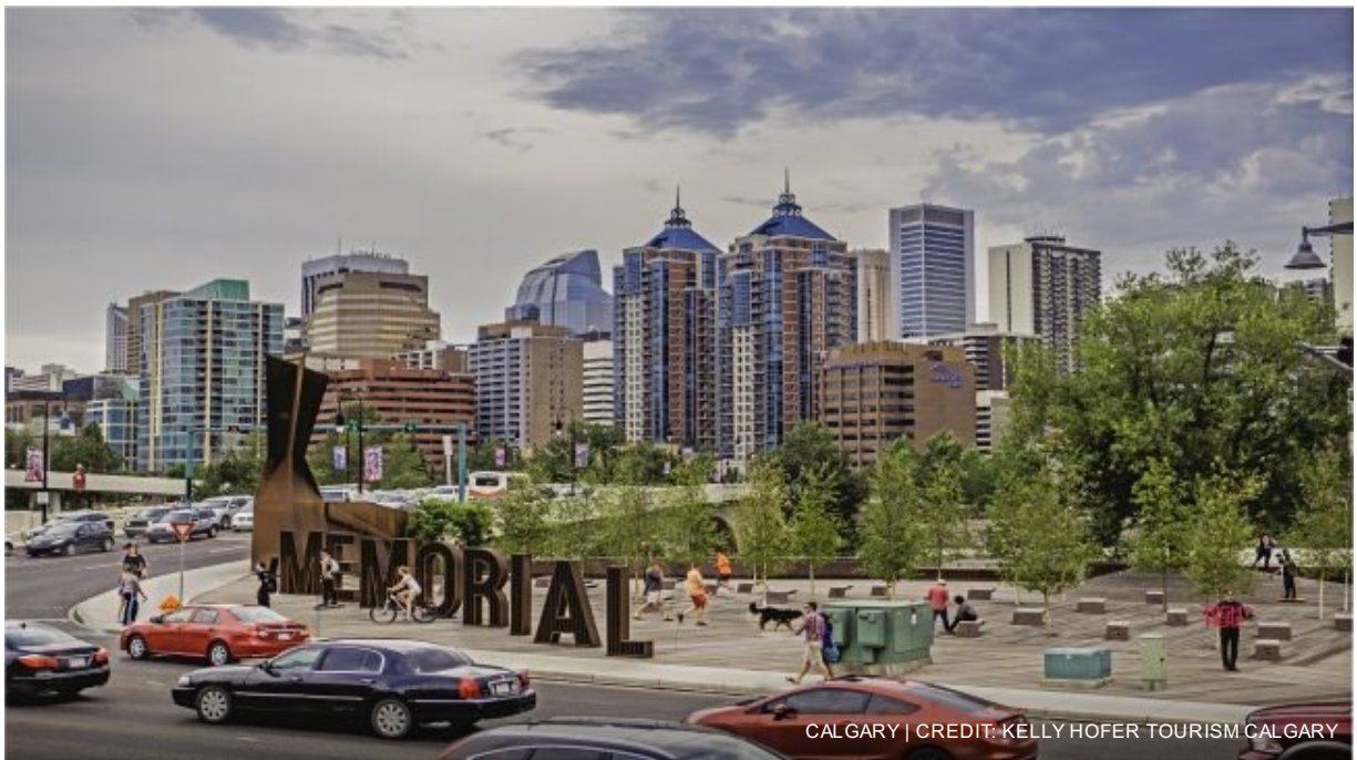
CALGARY

Overnight in Calgary at the Delta Calgary Downtown .