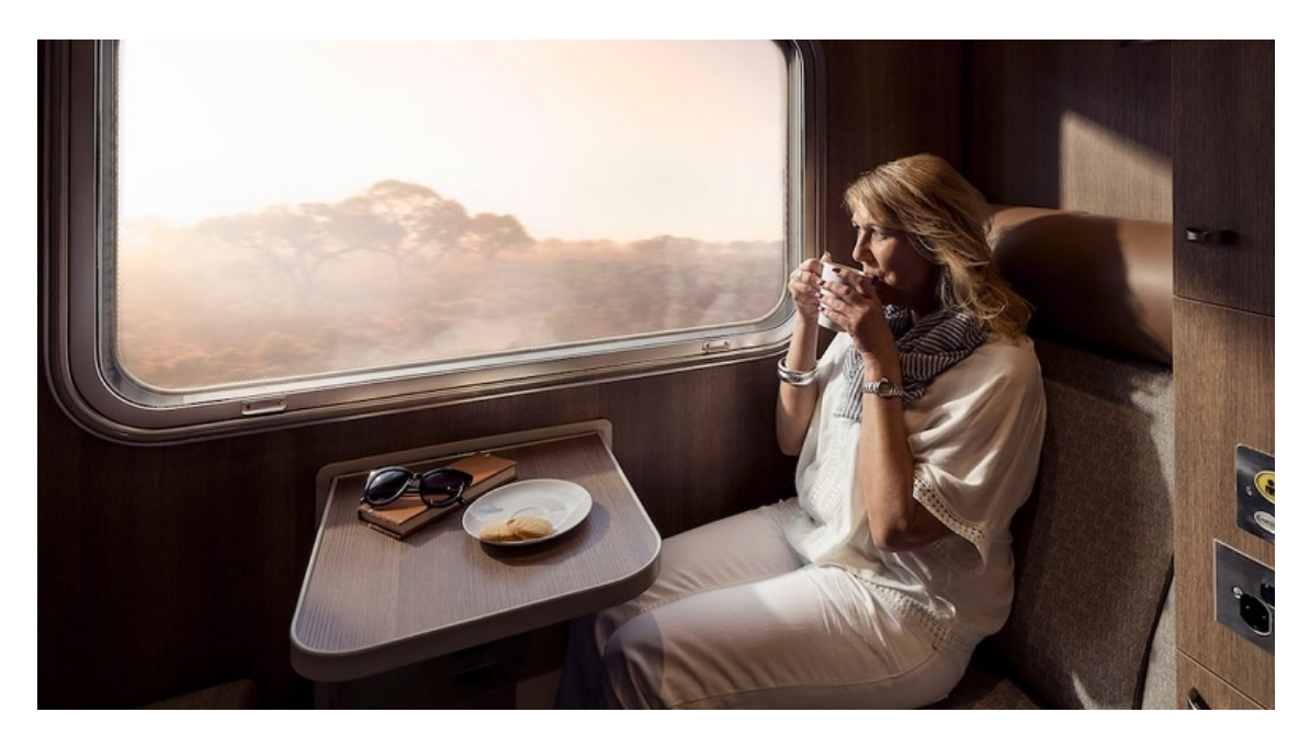
Prices are dynamic based on travel dates. Please proceed to Book Now or Contact Us for details.