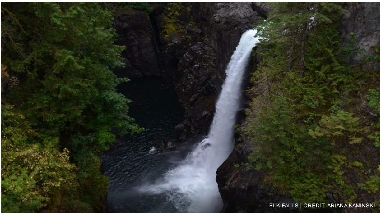
ELK FALLS