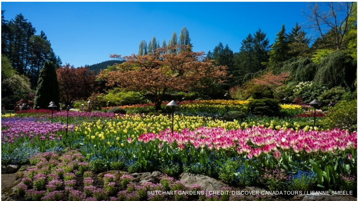
BUTCHART GARDENS