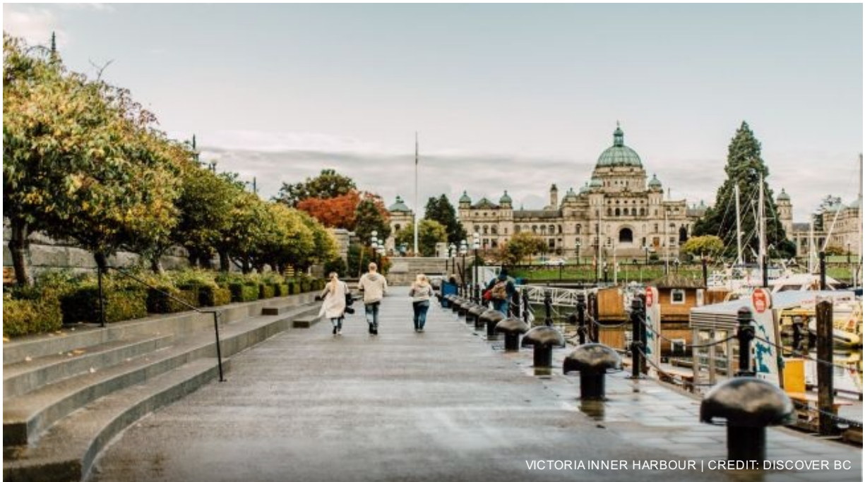
VICTORIA INNER HARBOUR