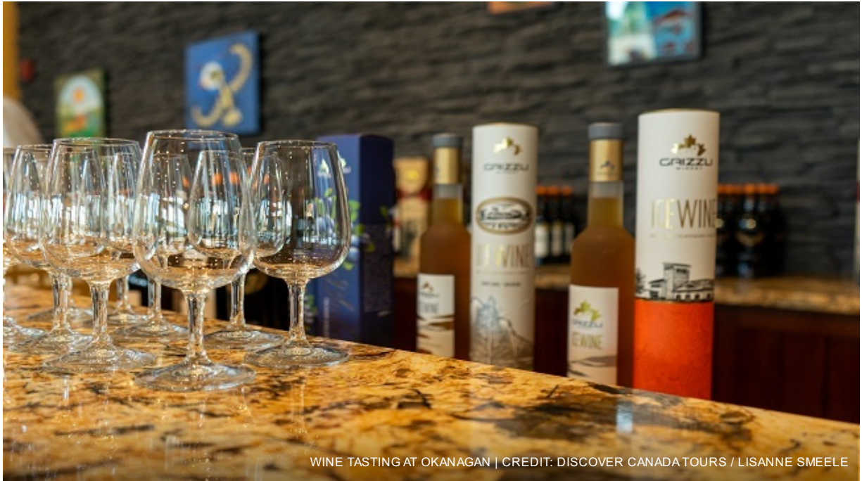
WINE TASTING AT OKANAGAN