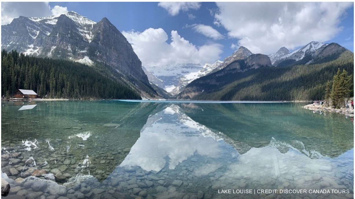
LAKE LOUISE