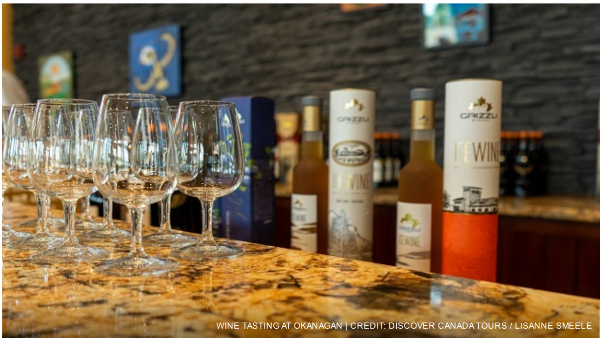
WINE TASTING AT OKANAGAN