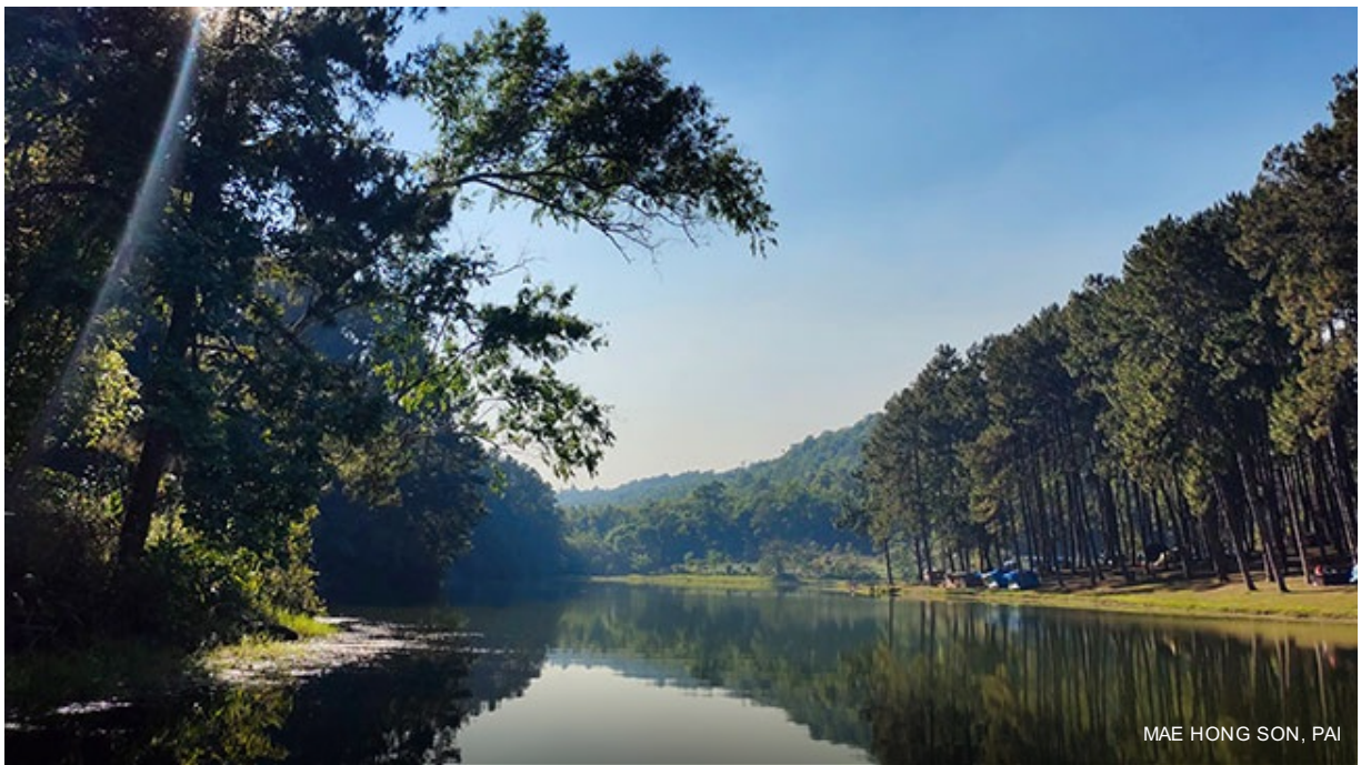
MAE HONG SON, PAI