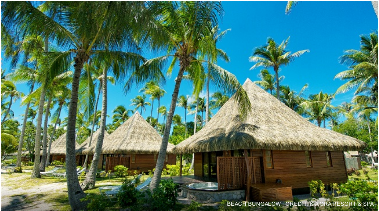
BEACH BUNGALOW