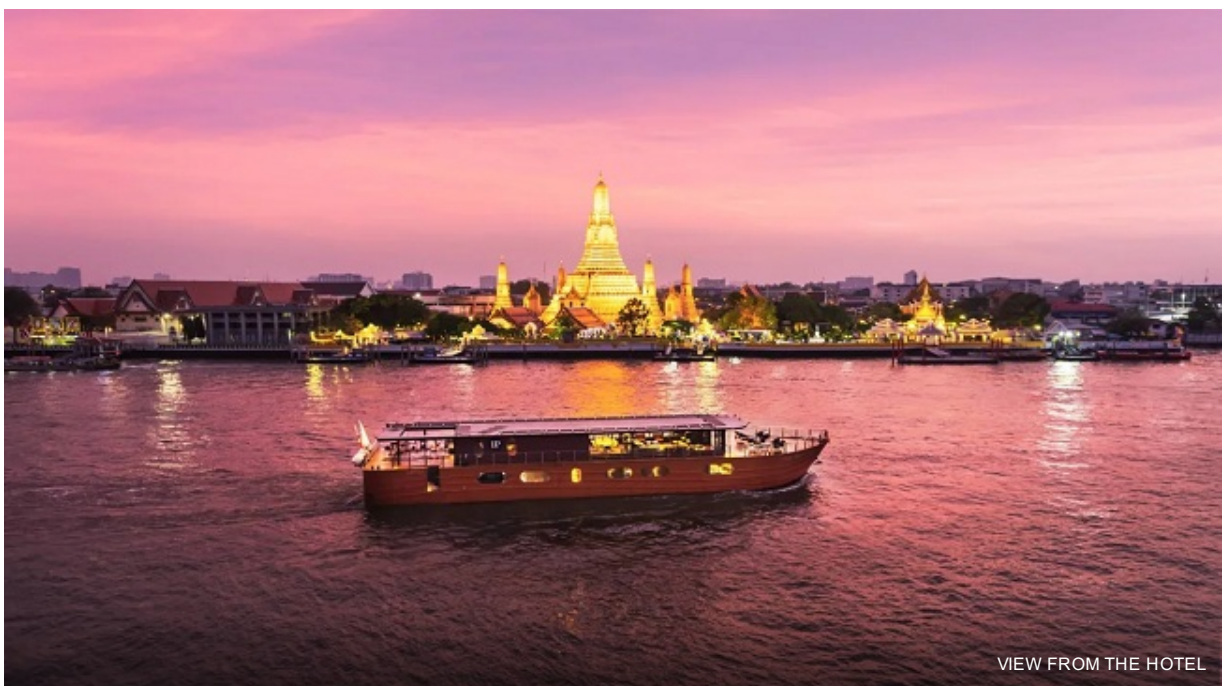
VIEW FROM THE HOTEL

Overnight stay in Anantara Riverside Bangkok Resort in a Deluxe Room.