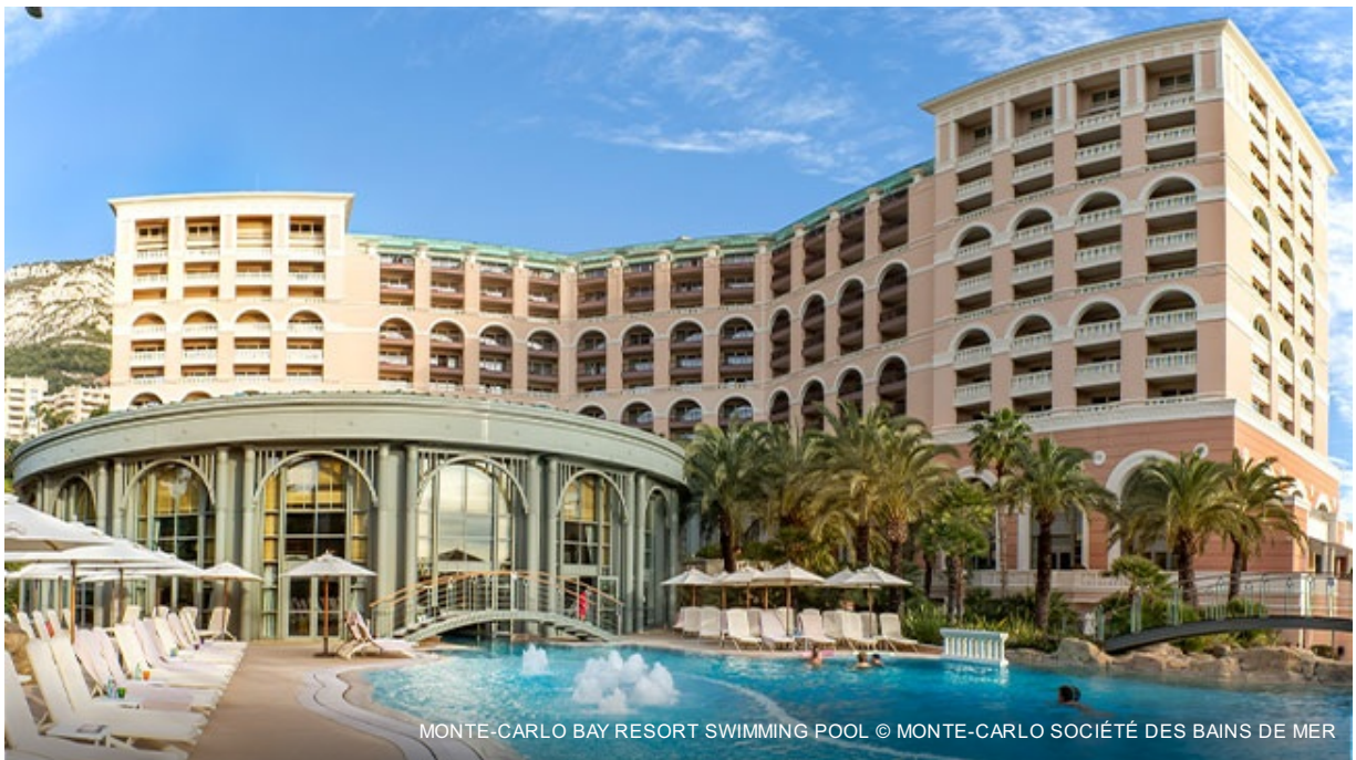
MONTE-CARLO BAY RESORT SWIMMING POOL