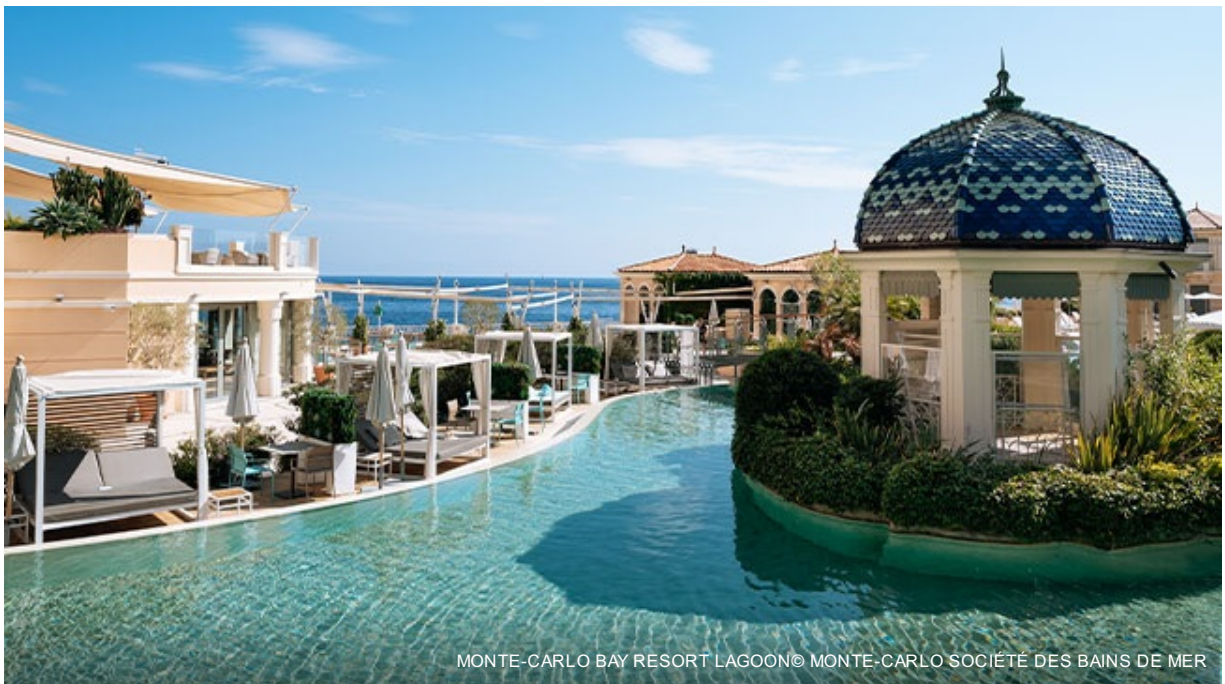
MONTE-CARLO BAY RESORT LAGOON