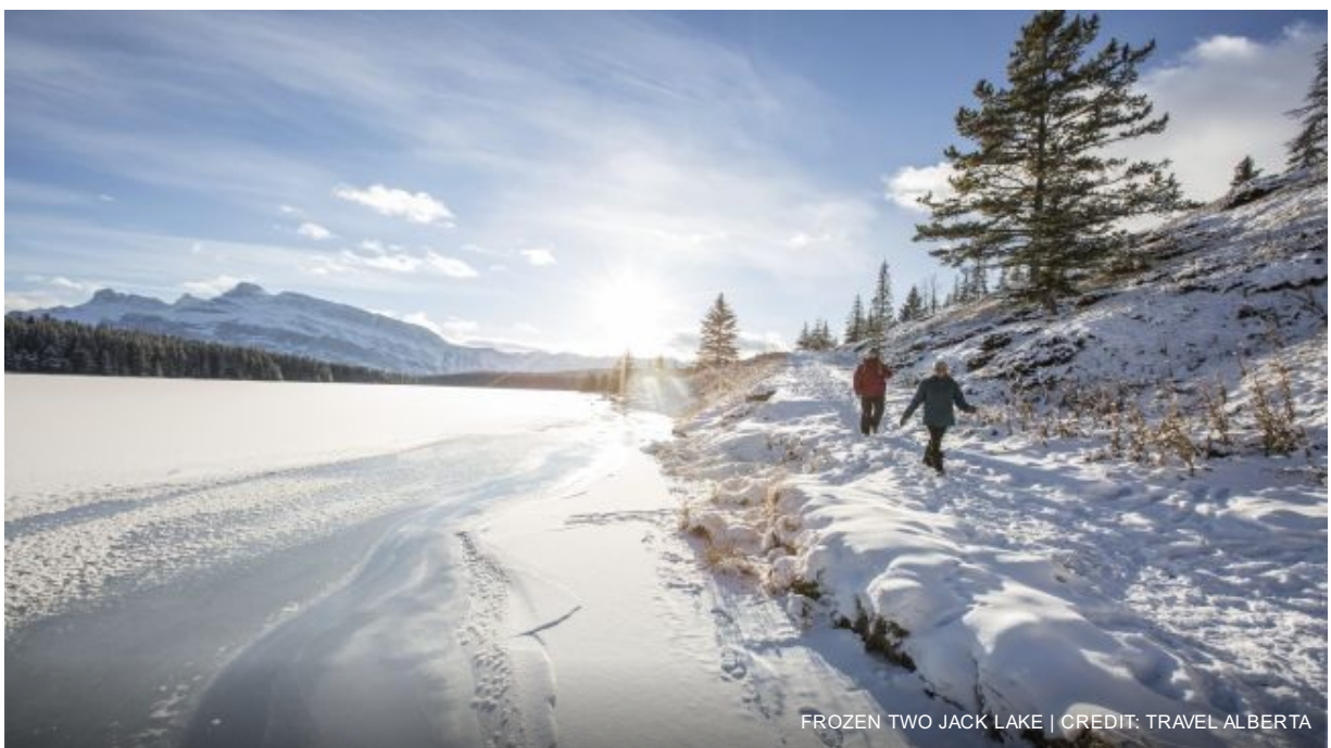
FROZEN TWO JACK LAKE

Overnight in Banff at Fairmont Banff Springs .