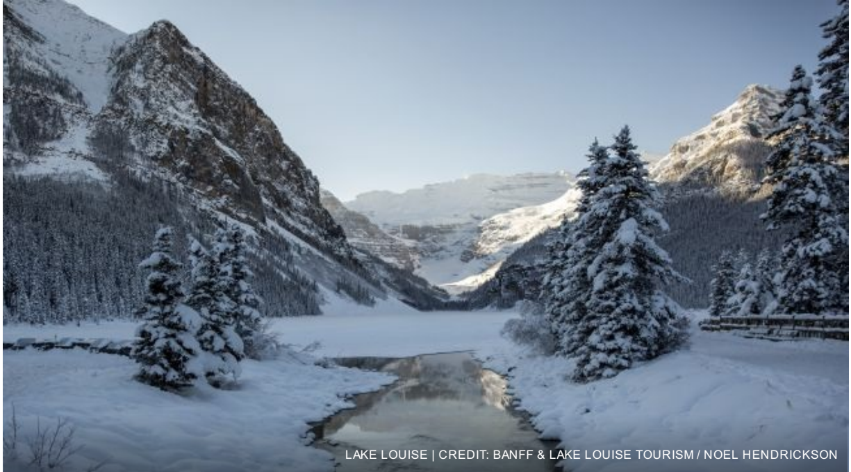
LAKE LOUISE | CREDIT: BANFF & LAKE LOUISE TOURISM / NOEL HENDRICKSON

Overnight in Banff at Fairmont Banff Springs .