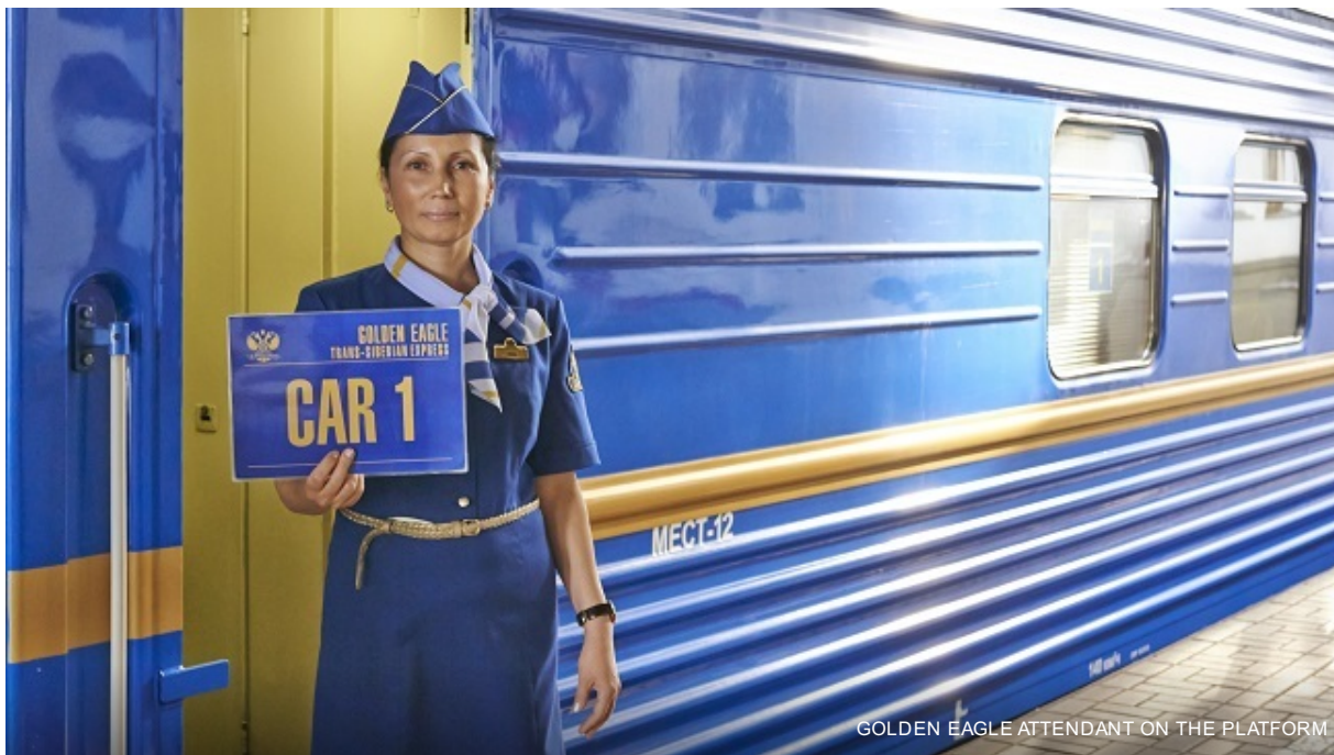
GOLDEN EAGLE ATTENDANT ON THE PLATFORM