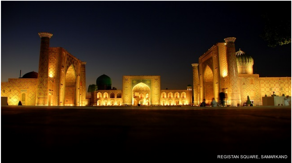
REGISTAN SQUARE, SAMARKAND