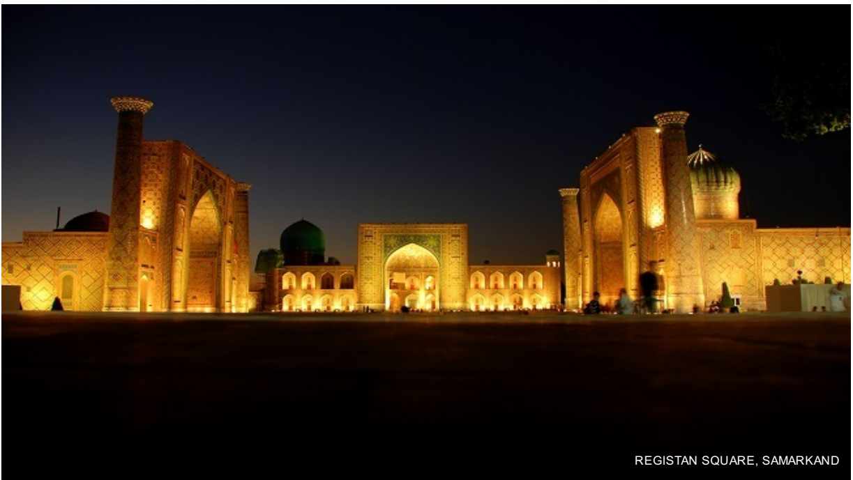
REGISTAN SQUARE, SAMARKAND