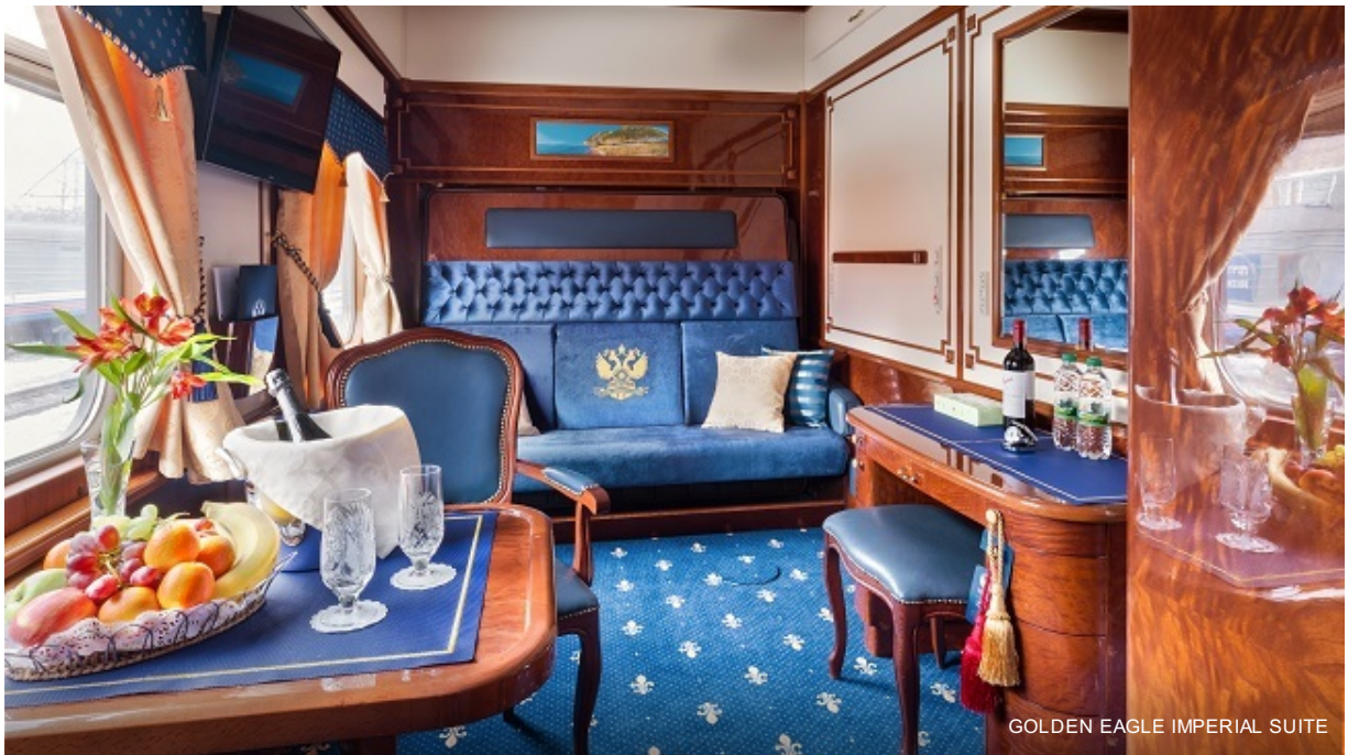
GOLDEN EAGLE IMPERIAL SUITE