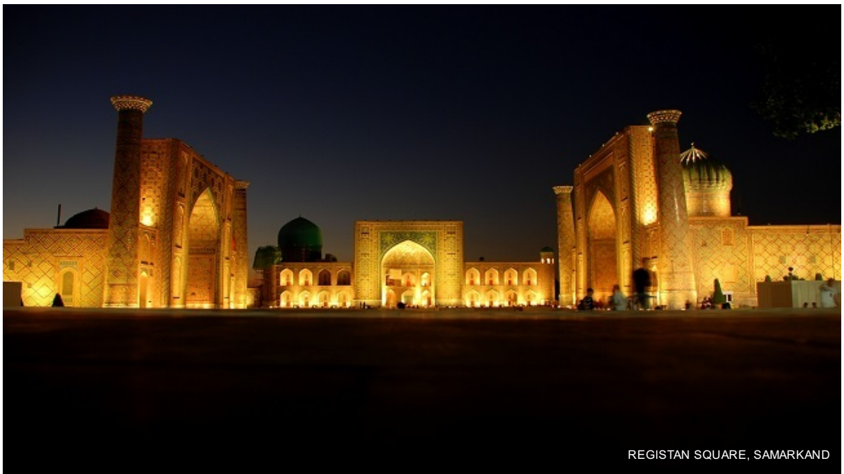
REGISTAN SQUARE, SAMARKAND