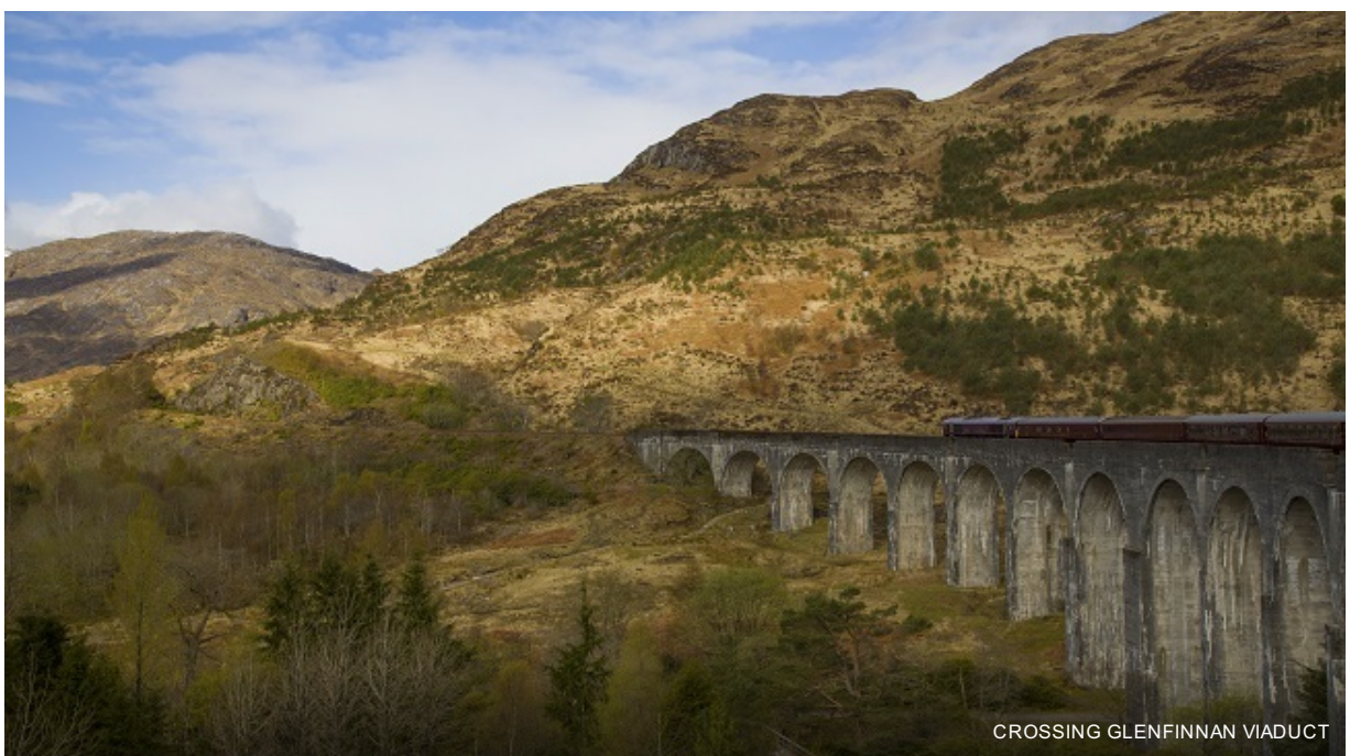
CROSSING GLENFINNAN VIADUCT