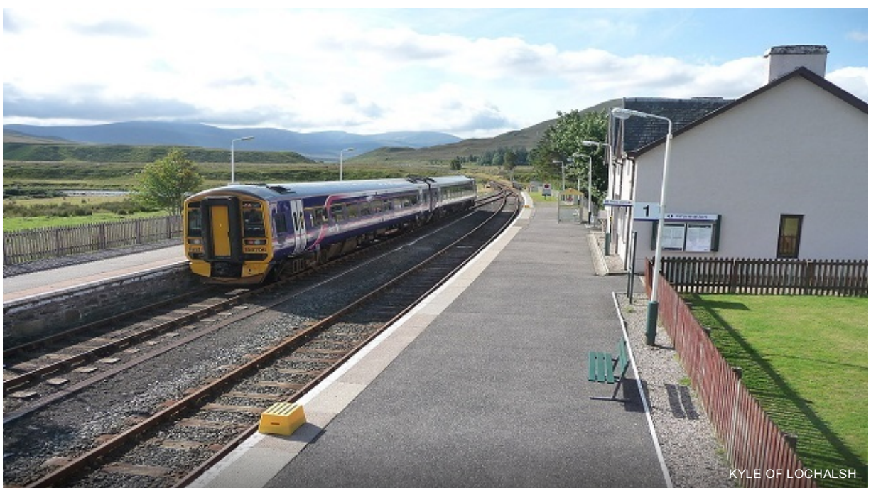
KYLE OF LOCHALSH