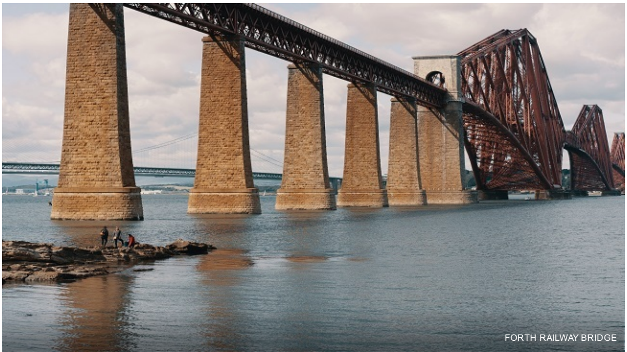
FORTH RAILWAY BRIDGE