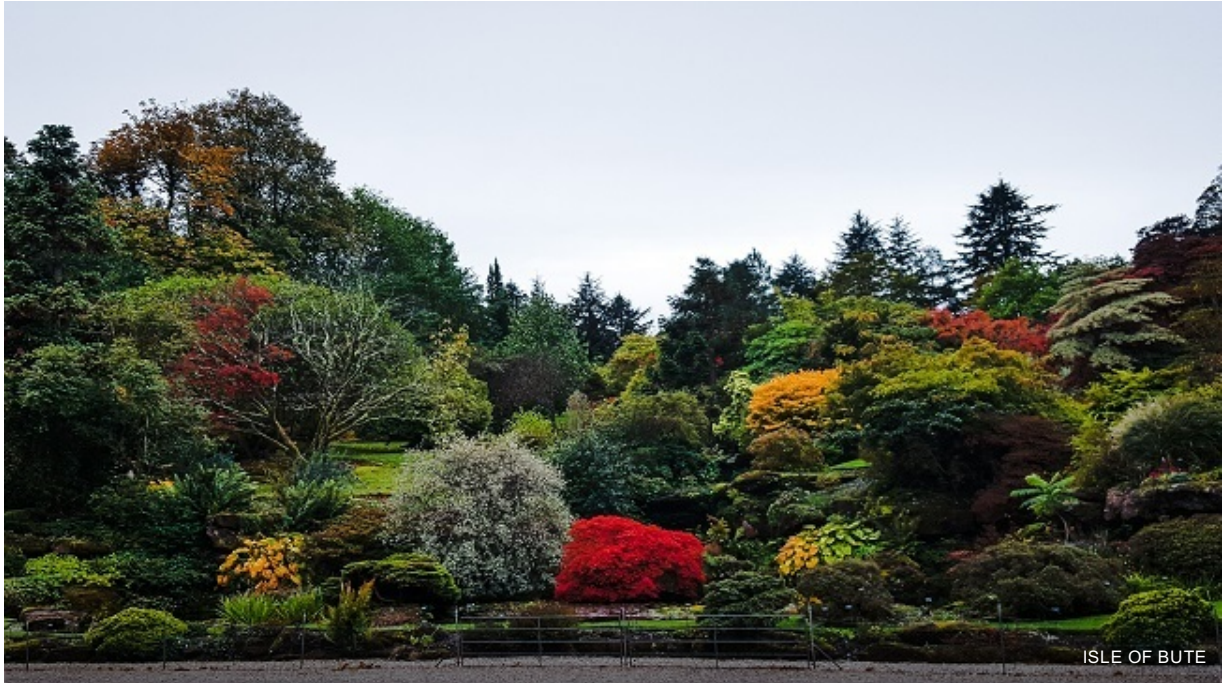
ISLE OF BUTE