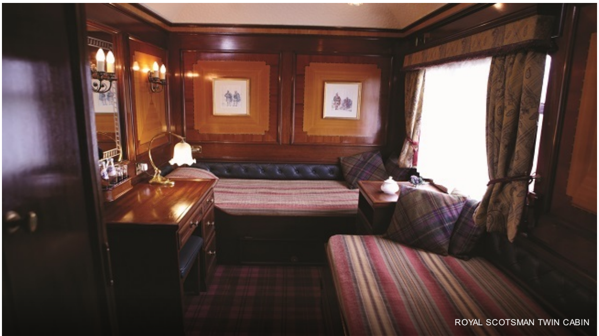
ROYAL SCOTSMAN TWIN CABIN