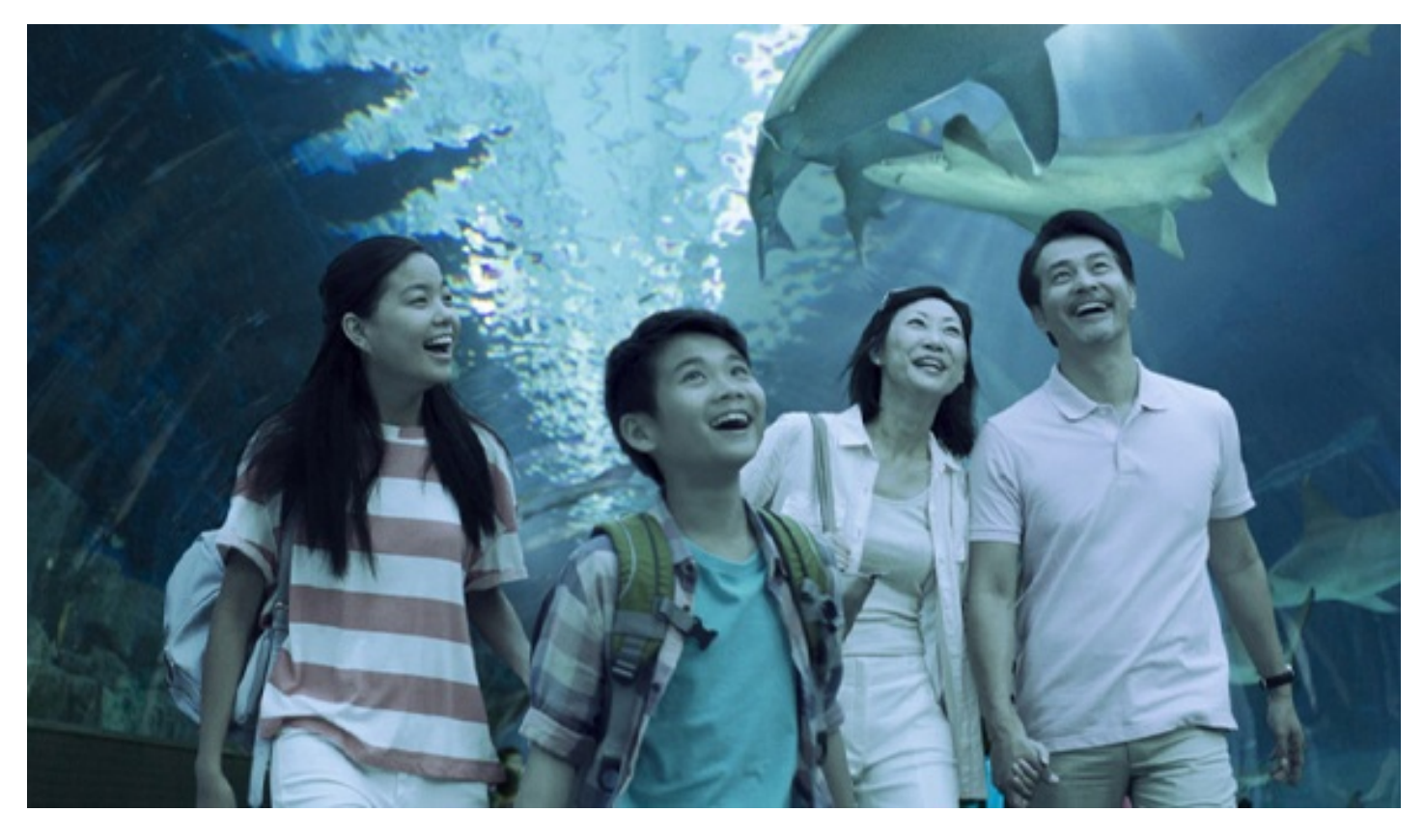
Prices are dynamic based on travel dates. Please proceed to Book Now or Contact Us for details.

Come face-to-face with more than 100,000 marine animals of over 1,000 species as you explore the enchanting marine realm at S.E.A. Aquarium. Enjoy a day of fun at the aquarium!