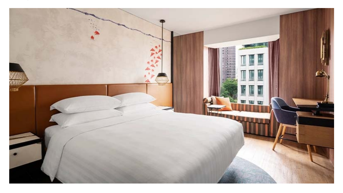
Prices are dynamic based on travel dates. Please proceed to Book Now or Contact Us for details.

Relax and rejuvenate in one of our bright and contemporary Deluxe Rooms. With our internet-enabled 40-inch smart TVs, you can watch anything you want and stay connected with fast, unlimited Wi-Fi. After a late-night movie marathon, simply dial the 24-hour room service number for all your food needs.