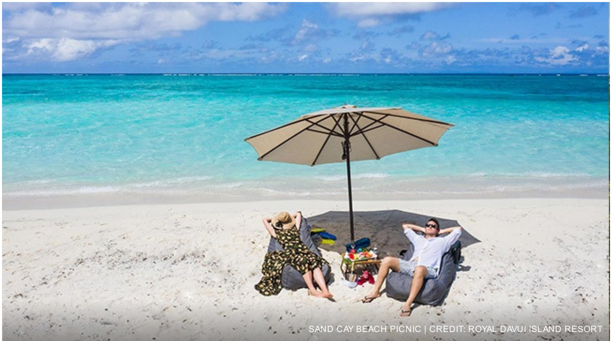
SAND CAY BEACH PICNIC