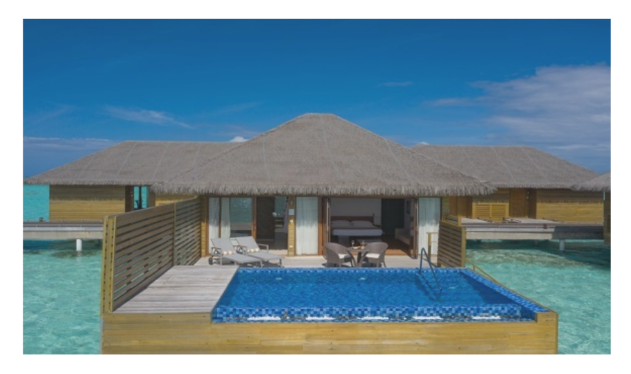
Prices are dynamic based on travel dates. Please proceed to Book Now or Contact Us for details.