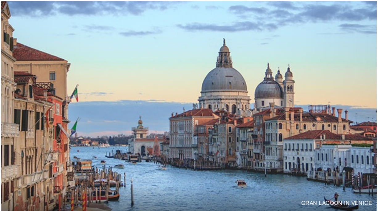
GRAN LAGOON IN VENICE