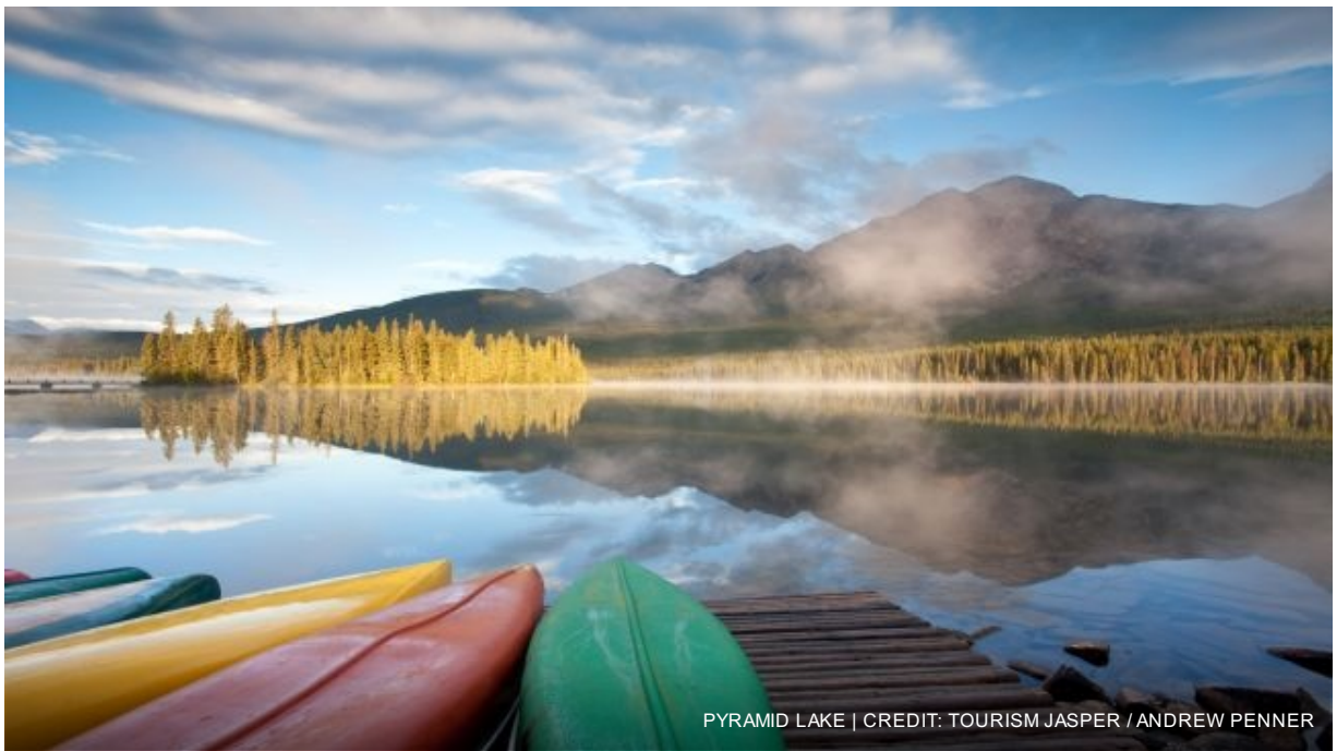
PYRAMID LAKE