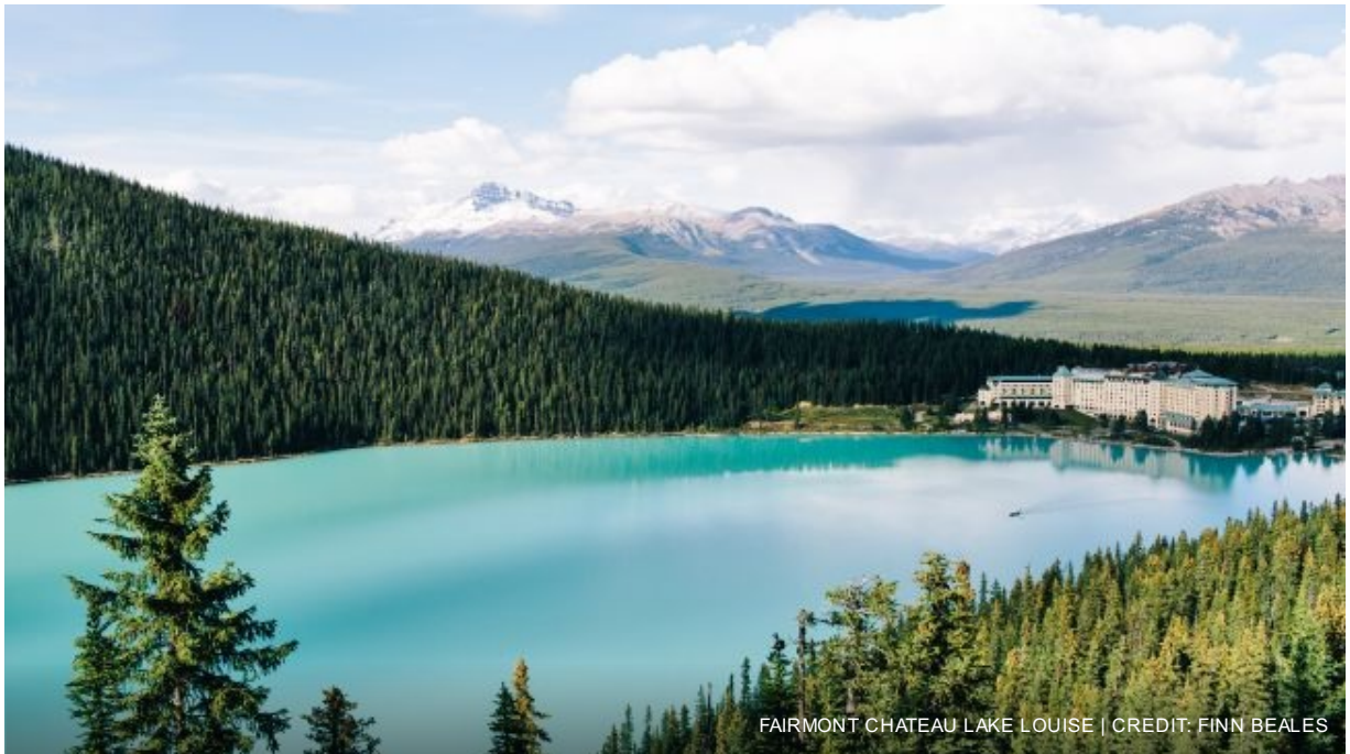
FAIRMONT CHATEAU LAKE LOUISE

Overnight in Lake Louise at Fairmont Chateau Lake Louise