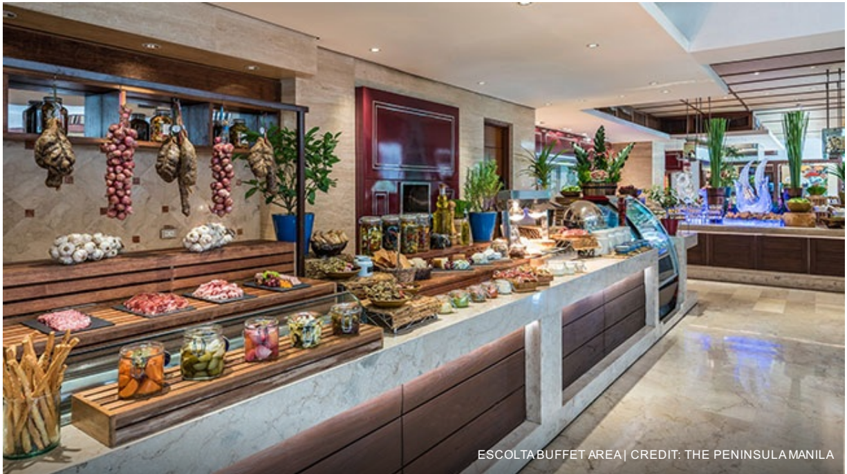
ESCOLTA BUFFET AREA