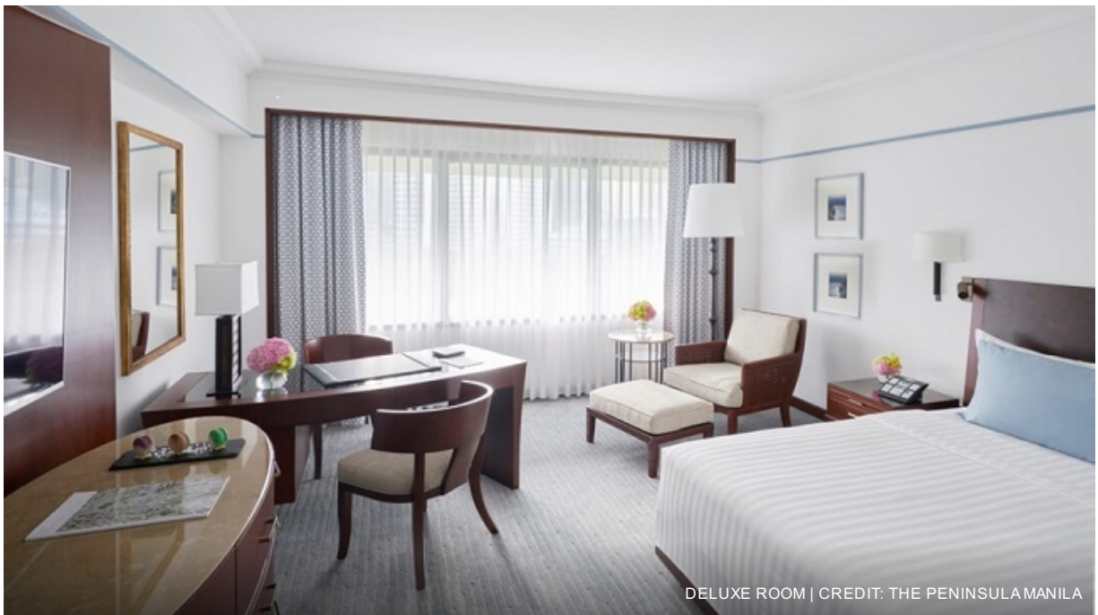
DELUXE ROOM

Overnight stay at The Peninsula Manila in a Deluxe Room.