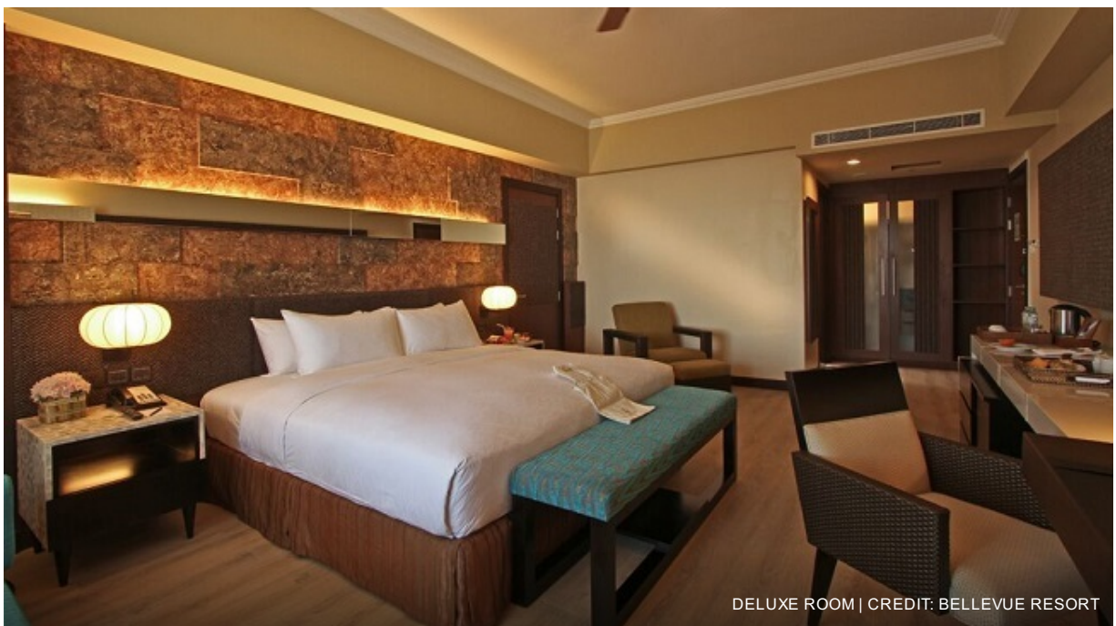
DELUXE ROOM

Overnight stay at Bellevue Resort in a Deluxe Room