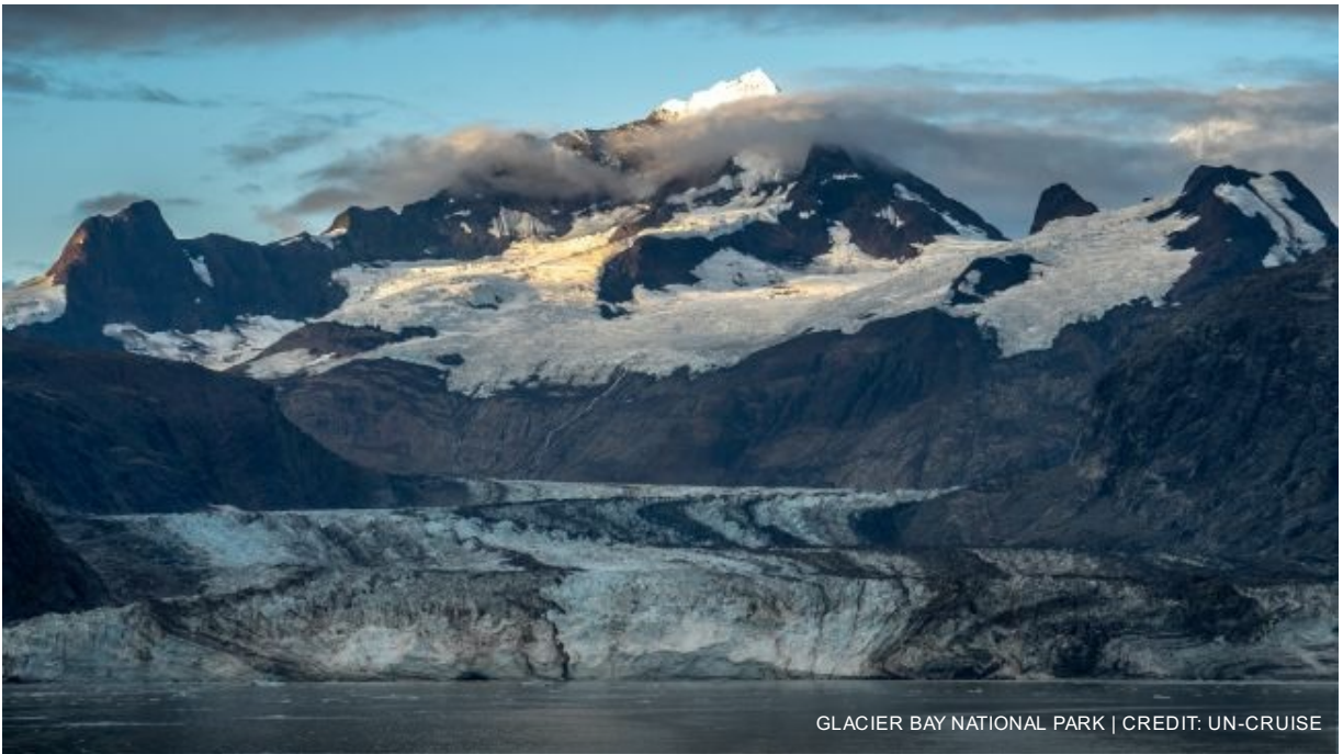
GLACIER BAY NATIONAL PARK