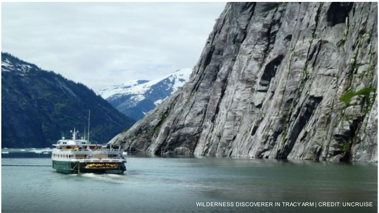
WILDERNESS DISCOVERER IN TRACY ARM