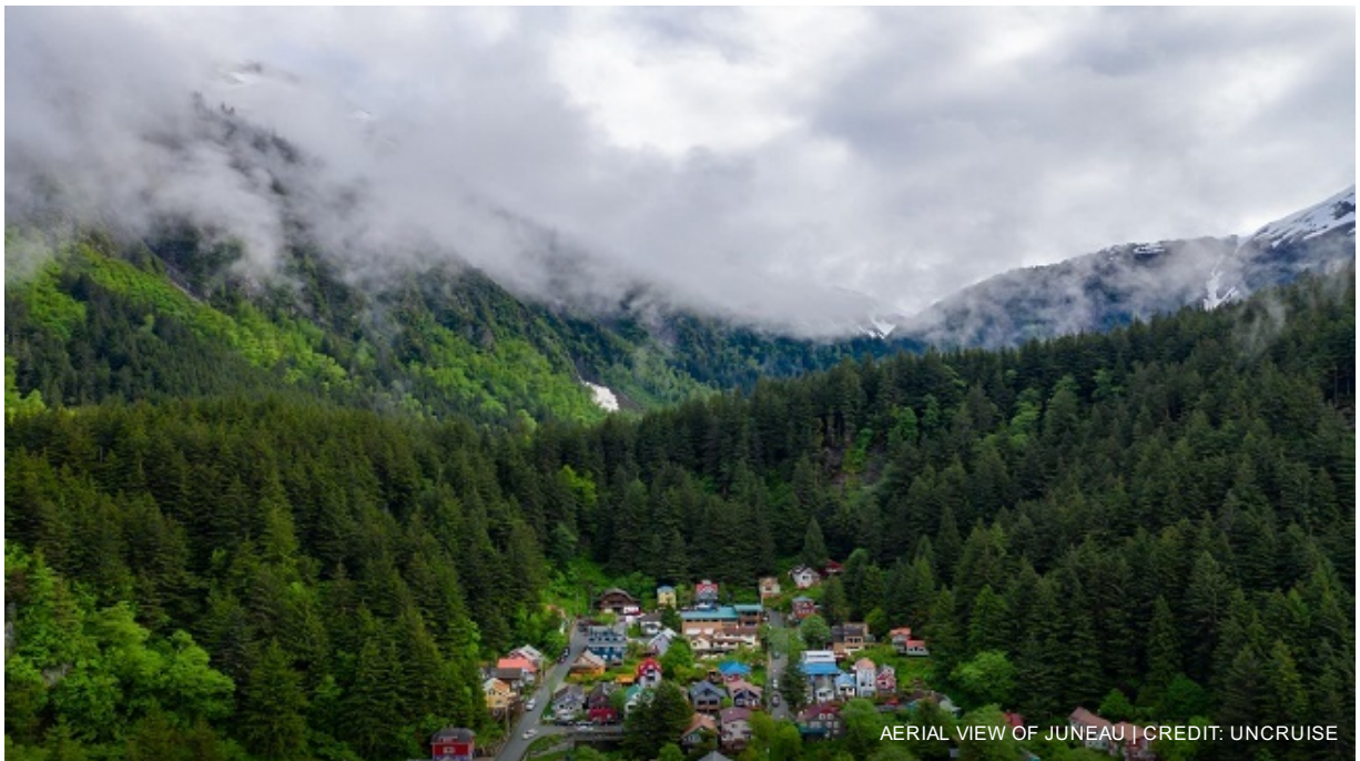
AERIAL VIEW OF JUNEAU