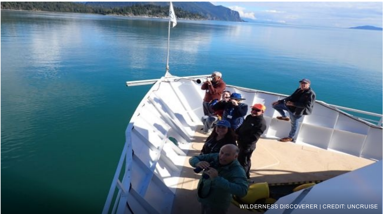
WILDERNESS DISCOVERER