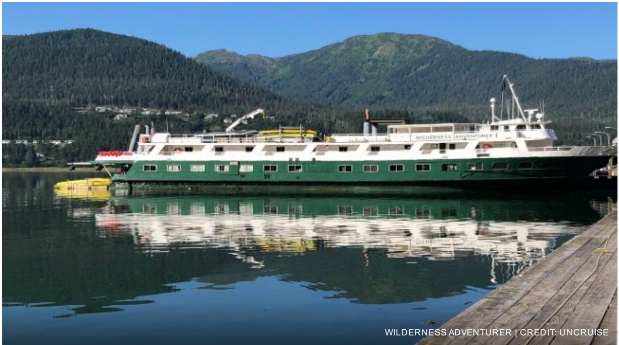
WILDERNESS ADVENTURER

Onboard amenities include; EZ dock kayak launch platform, bow-mounted underwater camera, kayaks, paddleboards, inflatable skiffs, hiking poles, snorkel gear/wetsuits, an on-deck hot tub, fitness equipment and yoga mats, movie and book library.