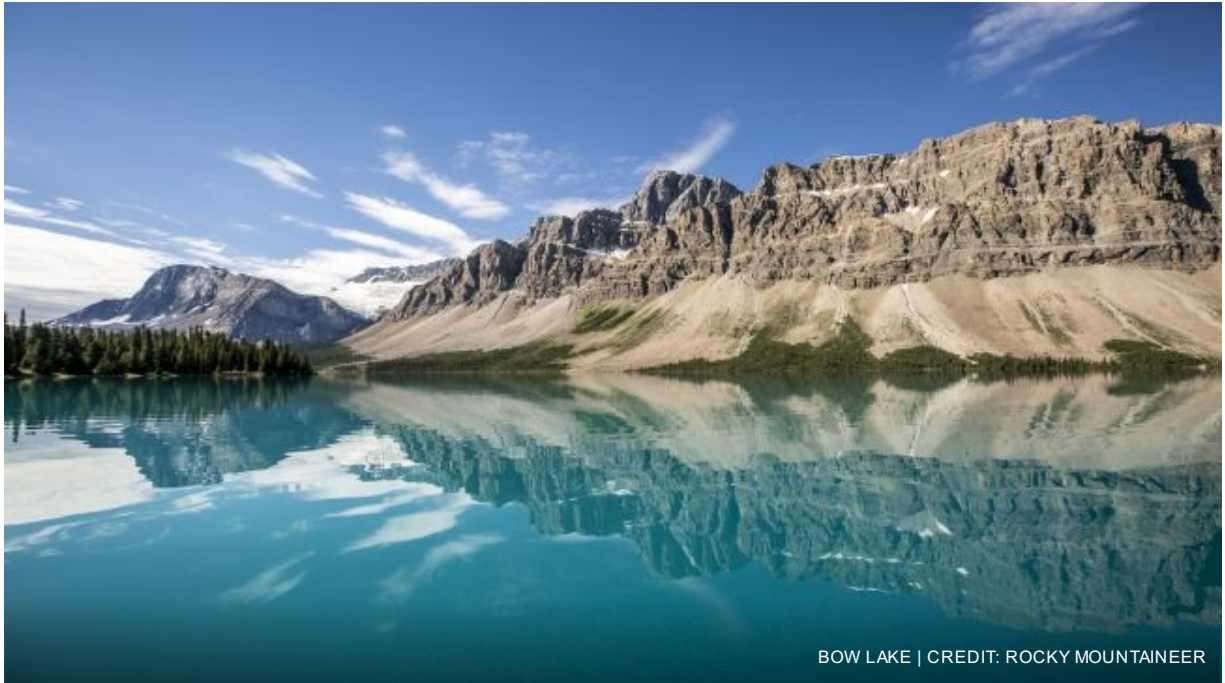
BOW LAKE

Saddle up for a journey through the celebrated landscape of Banff National Park on this guided horseback riding adventure.