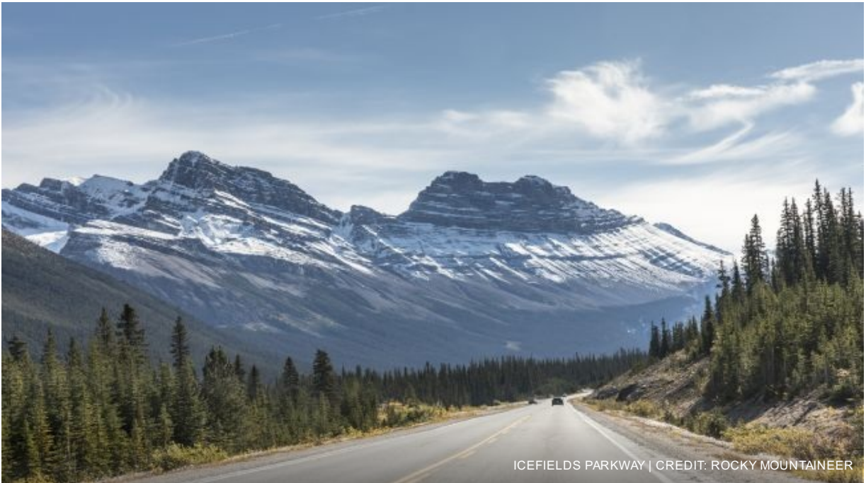
ICEFIELDS PARKWAY

Overnight in Lake Louise at Fairmont Chateau Lake Louise