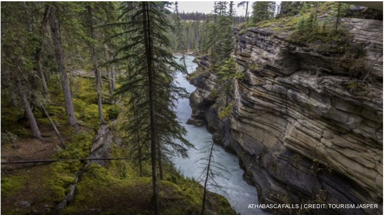
ATHABASCA FALLS