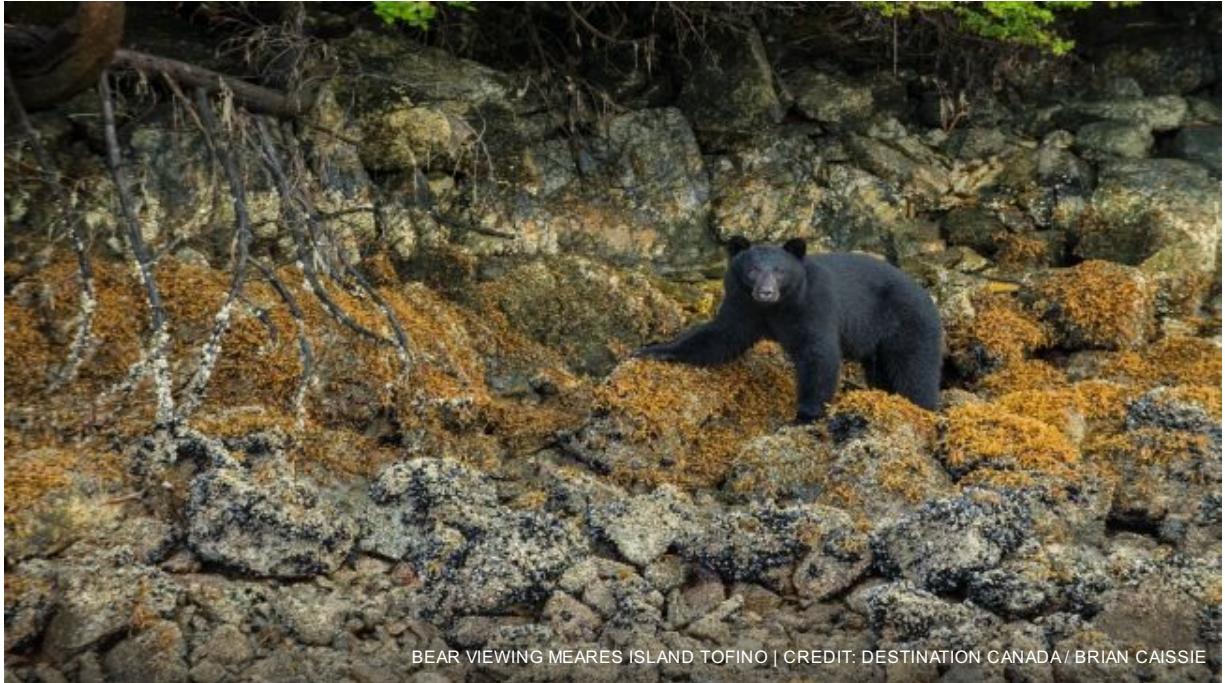
BEAR VIEWING MEARES ISLAND TOFINO | CREDIT: DESTINATION CANADA / BRIAN CAISSIE

Overnight in Tofino at Pacific Sands Beach Resort (or similar)