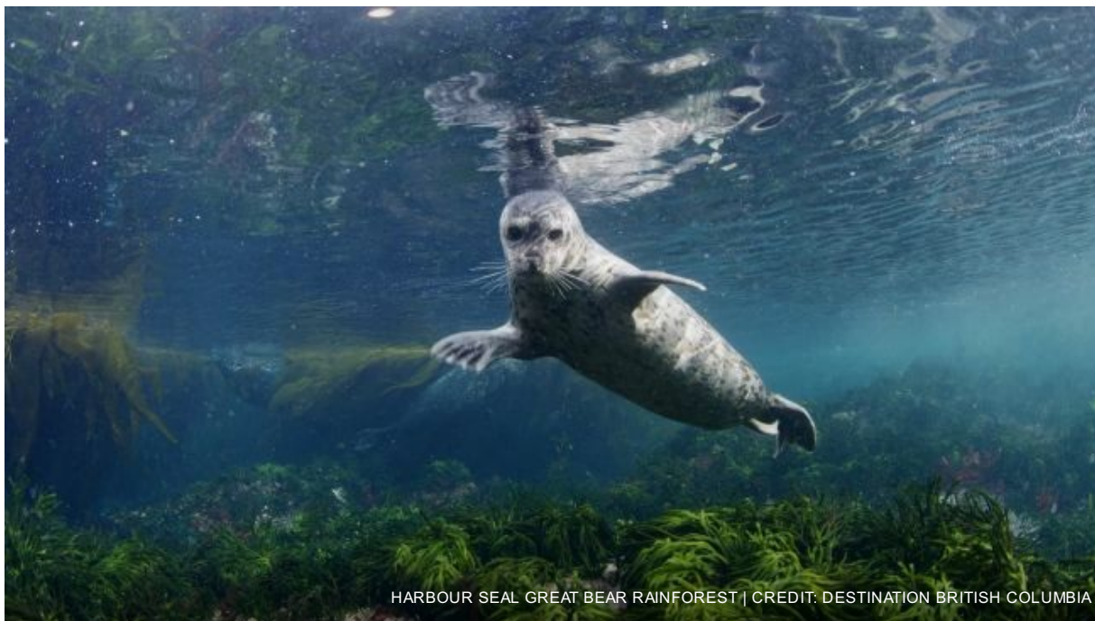
HARBOUR SEAL GREAT BEAR RAINFOREST