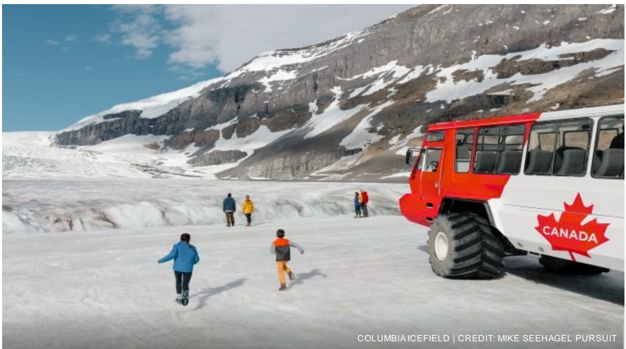
COLUMBIAICEFIELD