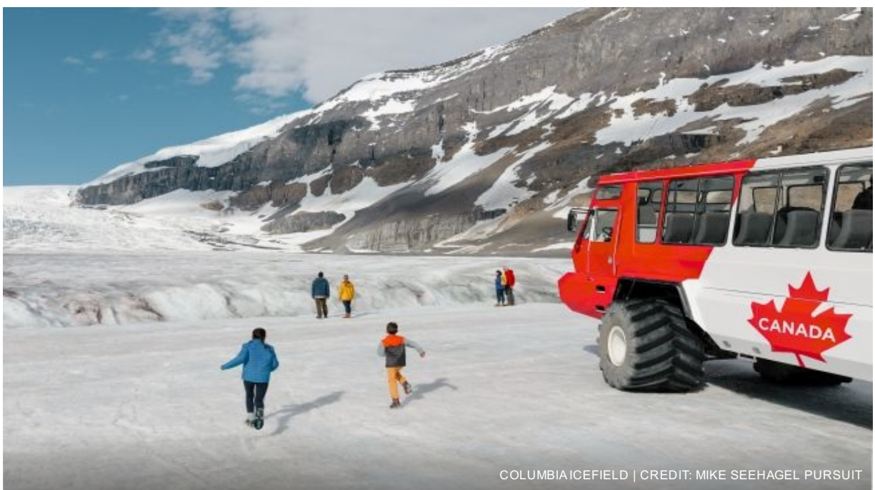
COLUMBIAICEFIELD