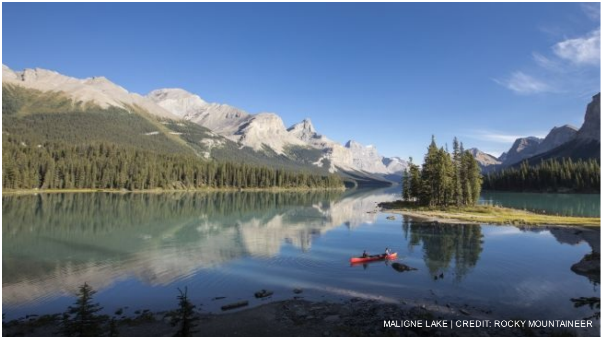
MALIGNE LAKE

Overnight in Jasper at the Fairmont Jasper Park Lodge