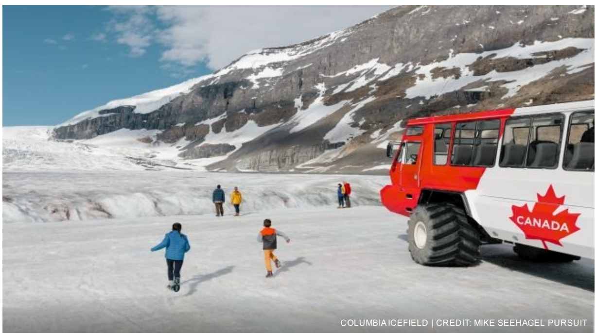
COLUMBIAICEFIELD