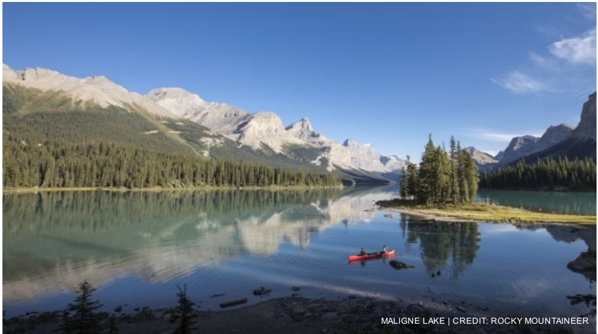
MALIGNE LAKE

Overnight in Jasper at the Fairmont Jasper Park Lodge