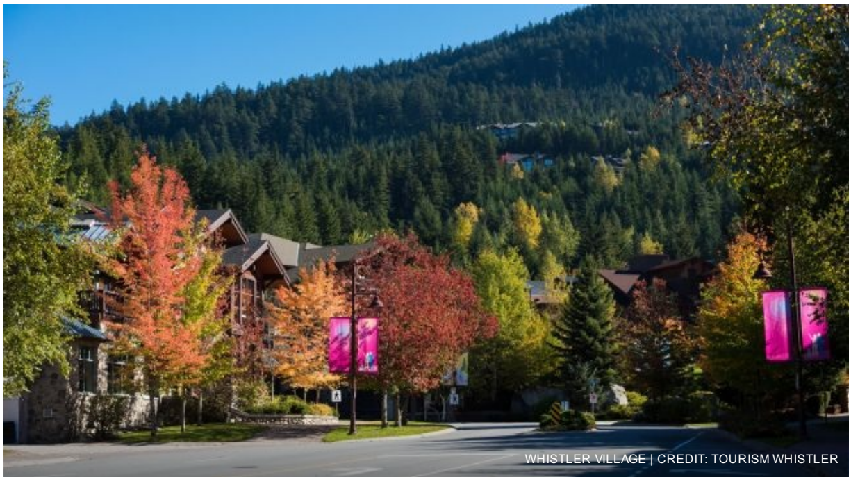
WHISTLER VILLAGE