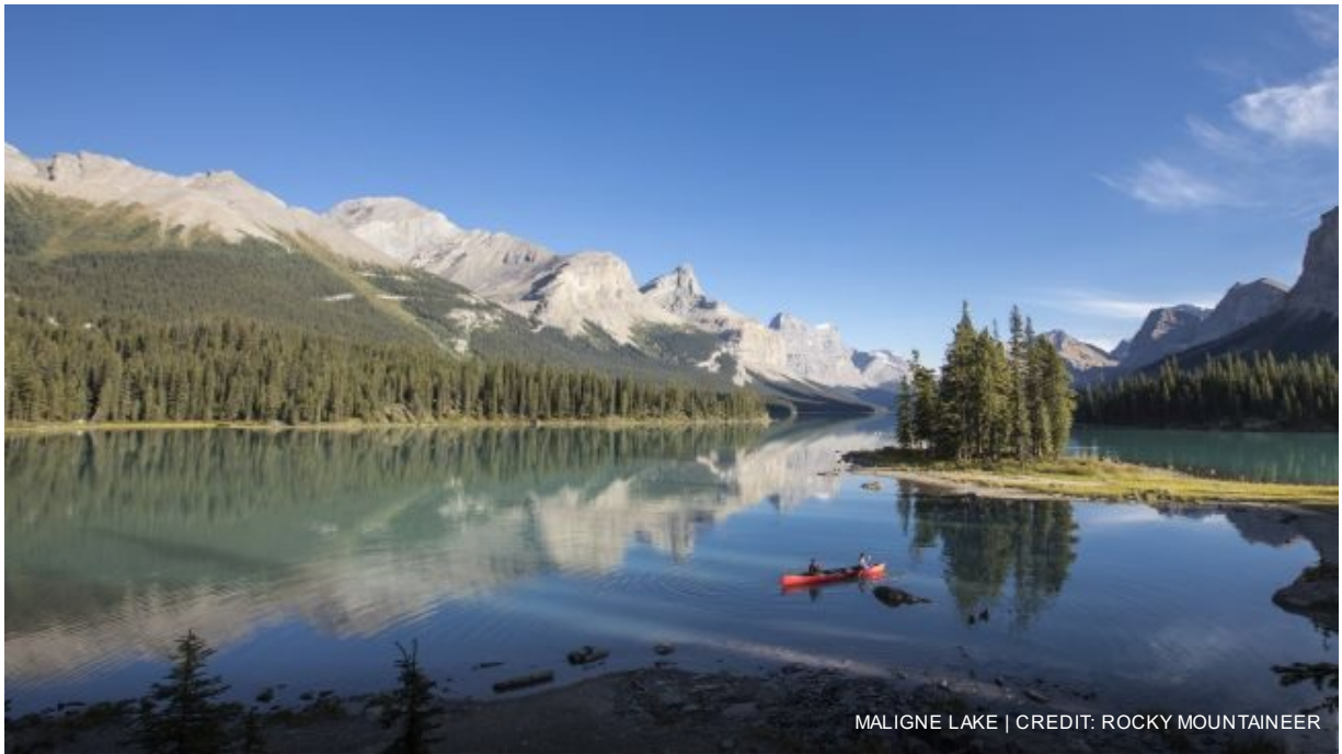
MALIGNE LAKE

Overnight in Jasper at the Fairmont Jasper Park Lodge