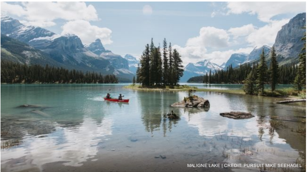
MALIGNE LAKE