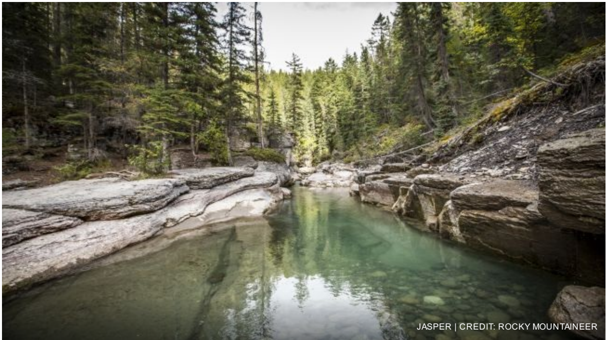
JASPER

Overnight in Jasper at the Fairmont Jasper Park Lodge