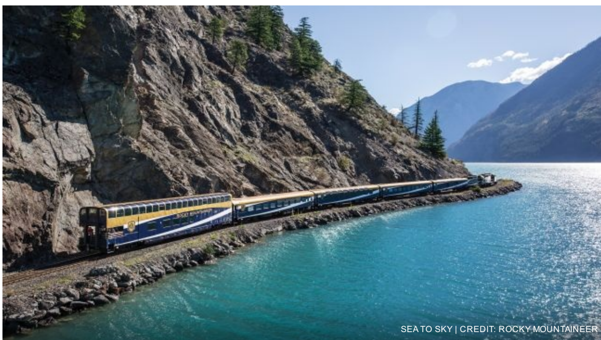
SEA TO SKY