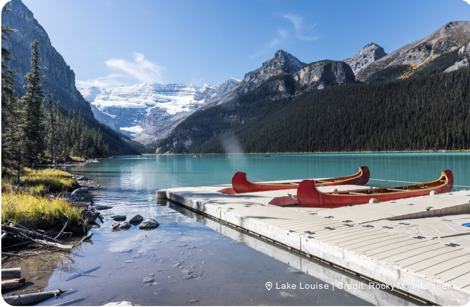
📍 Lake Louise