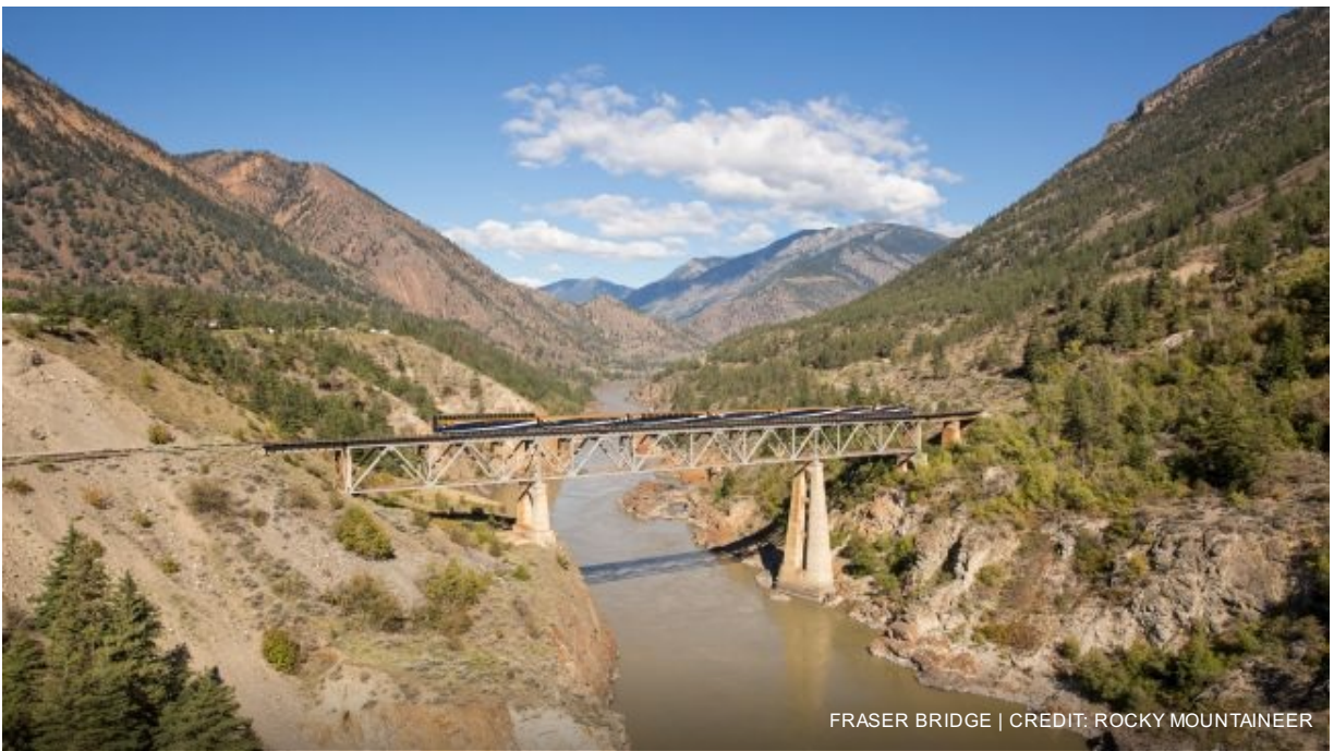
FRASER BRIDGE