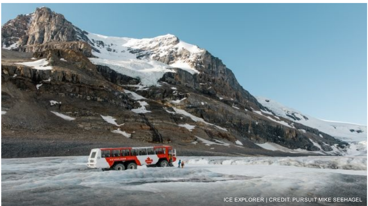
ICE EXPLORER