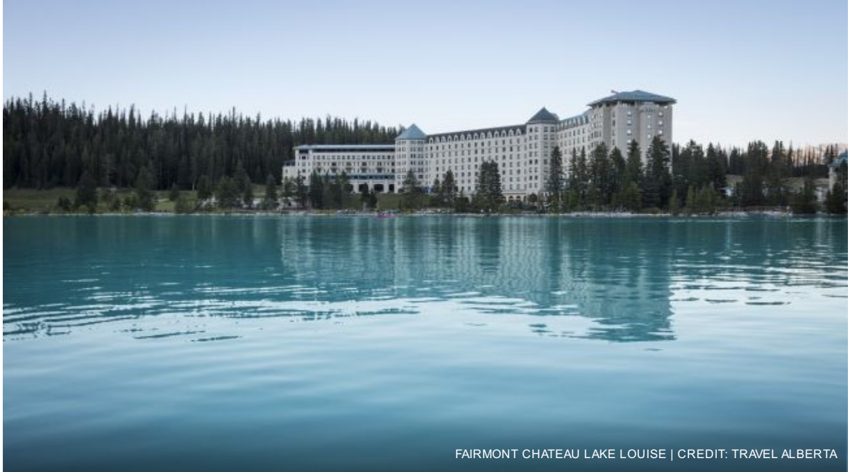
FAIRMONT CHATEAU LAKE LOUISE

Overnight in Lake Louise at the Fairmont Chateau Lake Louise