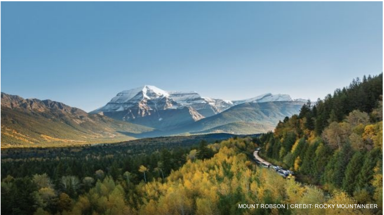
MOUNT ROBSON