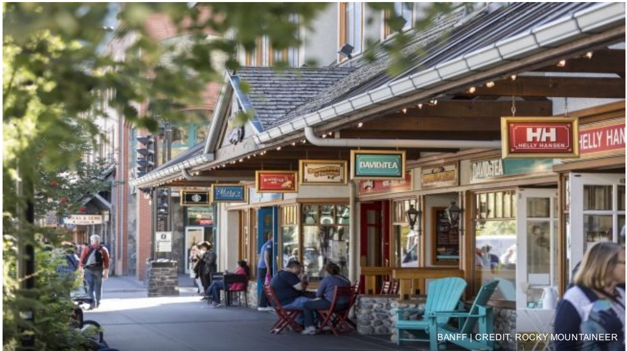
BANFF

Overnight in Banff at the Elk + Avenue Hotel (or similar)