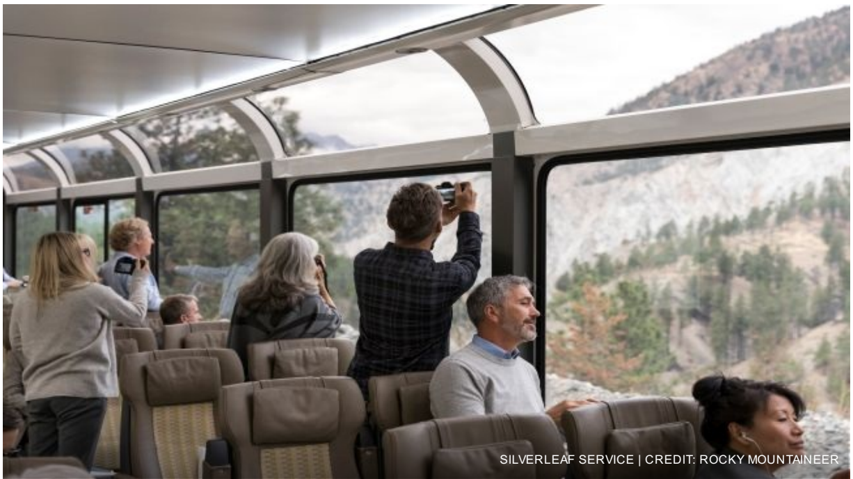
SILVERLEAF SERVICE