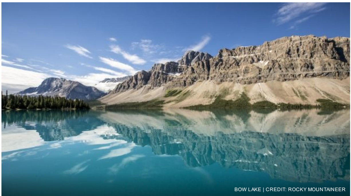
BOW LAKE

Overnight in Banff at the Elk + Avenue Hotel (or similar)