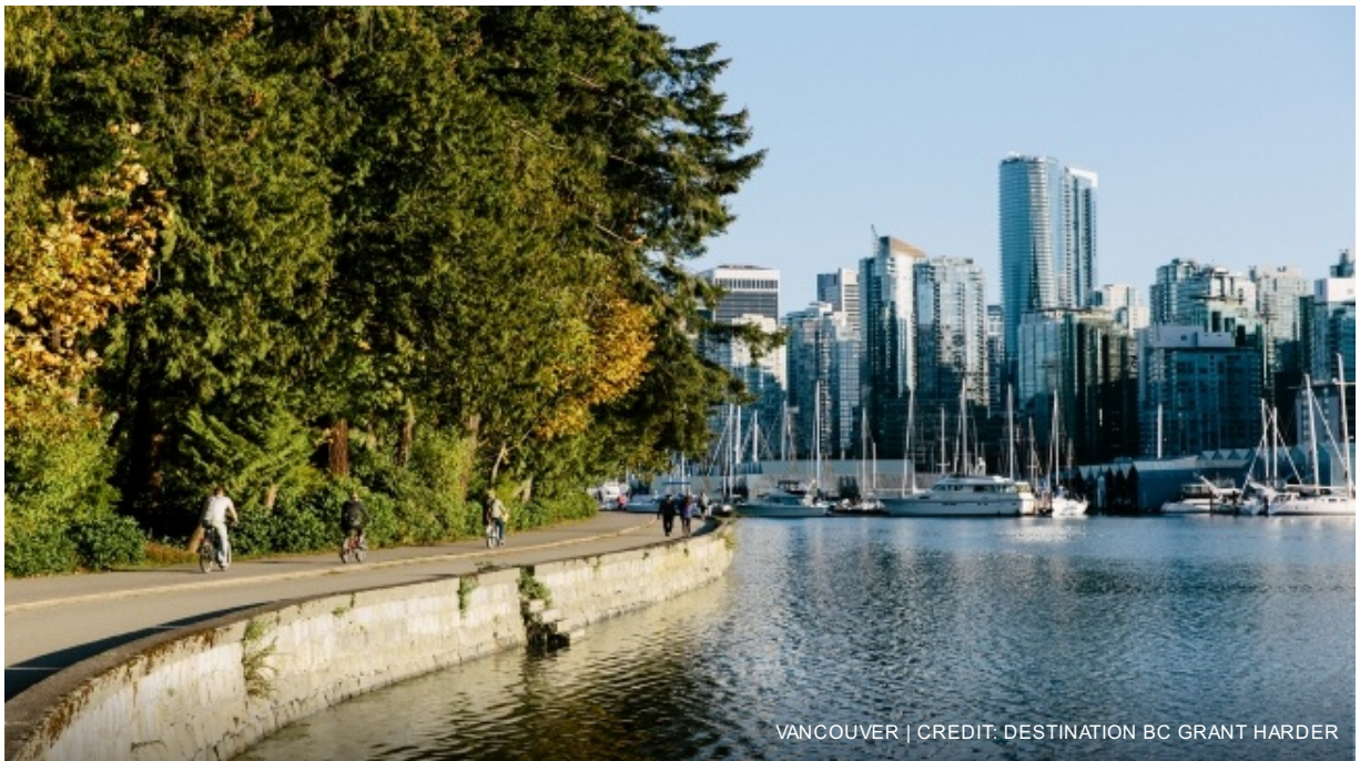
VANCOUVER

Overnight in Vancouver at the Sheraton Wall Centre (or similar)