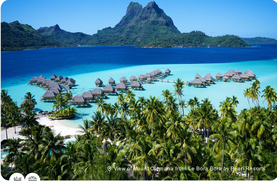
View of Mount Otemanu from Le Bora Bora by Pearl Resorts