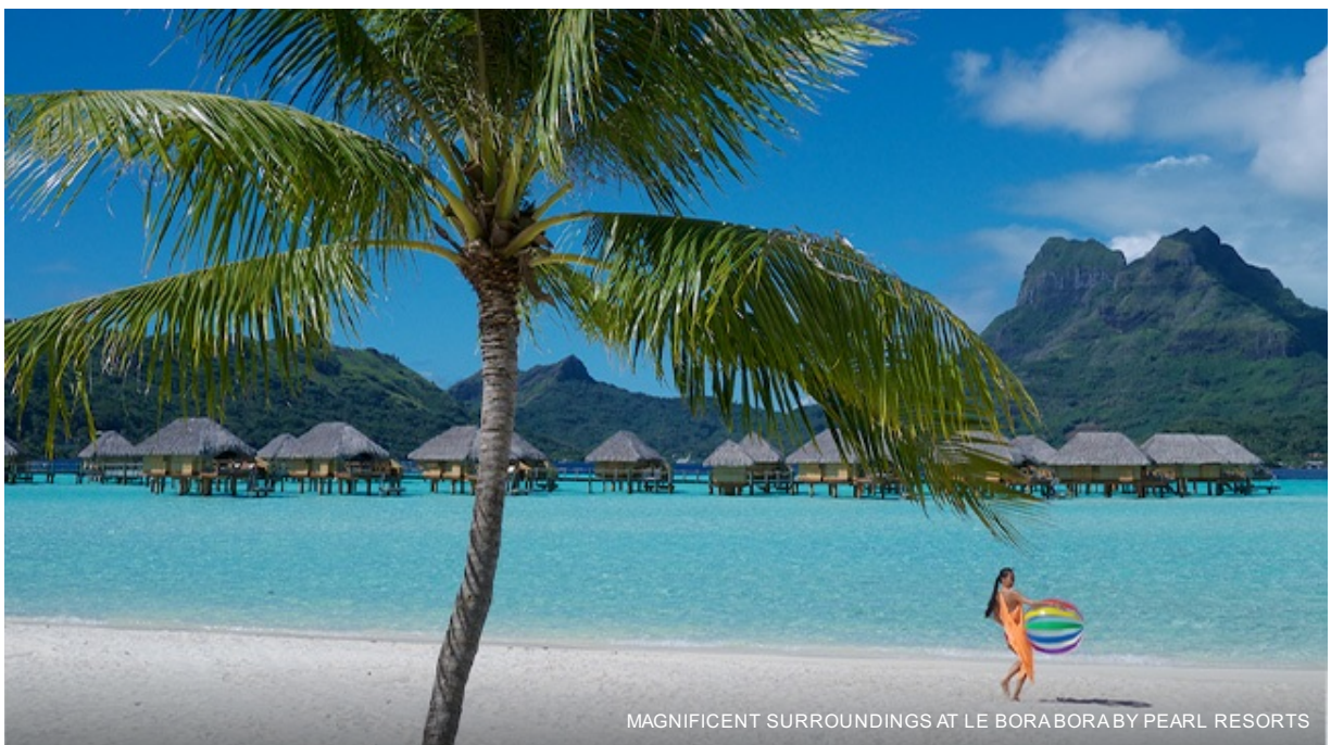
MAGNIFICENT SURROUNDINGS AT LE BORABORA BY PEARL RESORTS