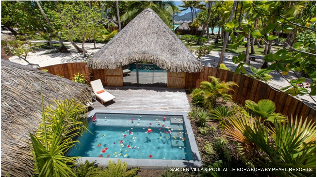
GARDEN VILLA & POOL AT LE BORABORA BY PEARL RESORTS