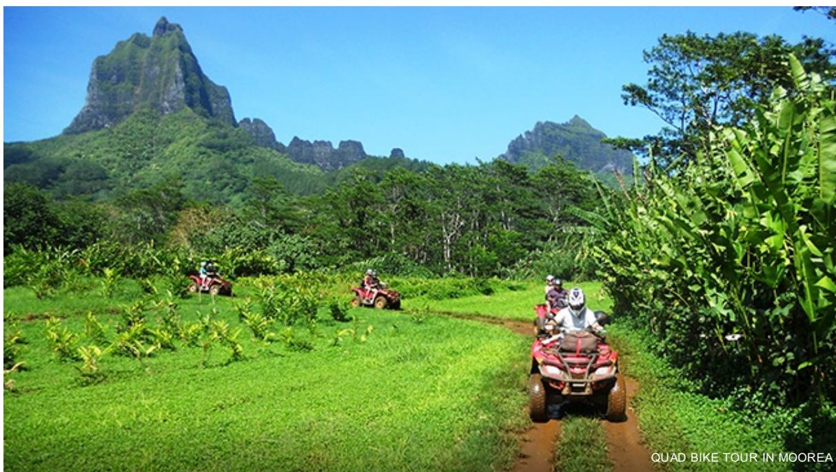
QUAD BIKE TOUR IN MOOREA