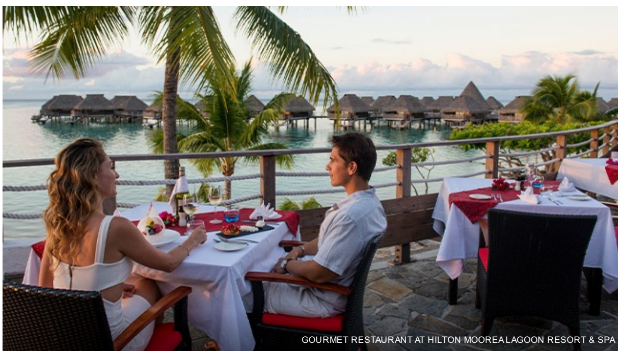
GOURMET RESTAURANT AT HILTON MOOREA LAGOON RESORT & SPA