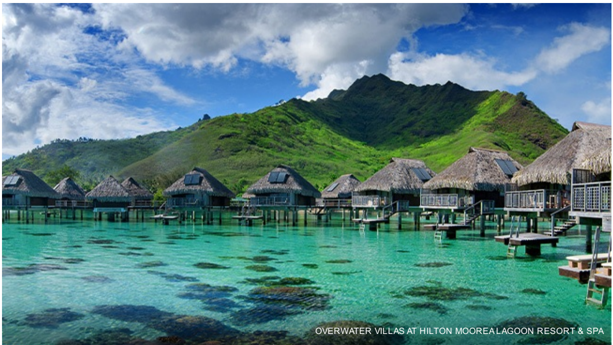
OVERWATER VILLAS AT HILTON MOOREALAGOON RESORT & SPA