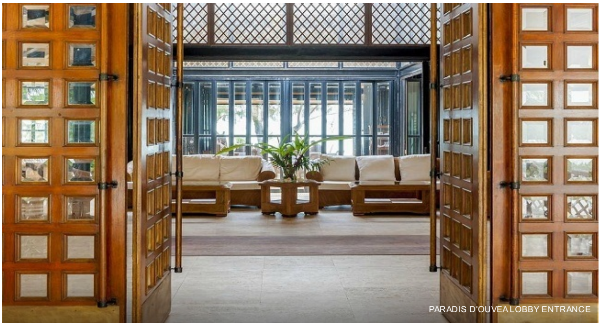
PARADIS D'OUVEA LOBBY ENTRANCE