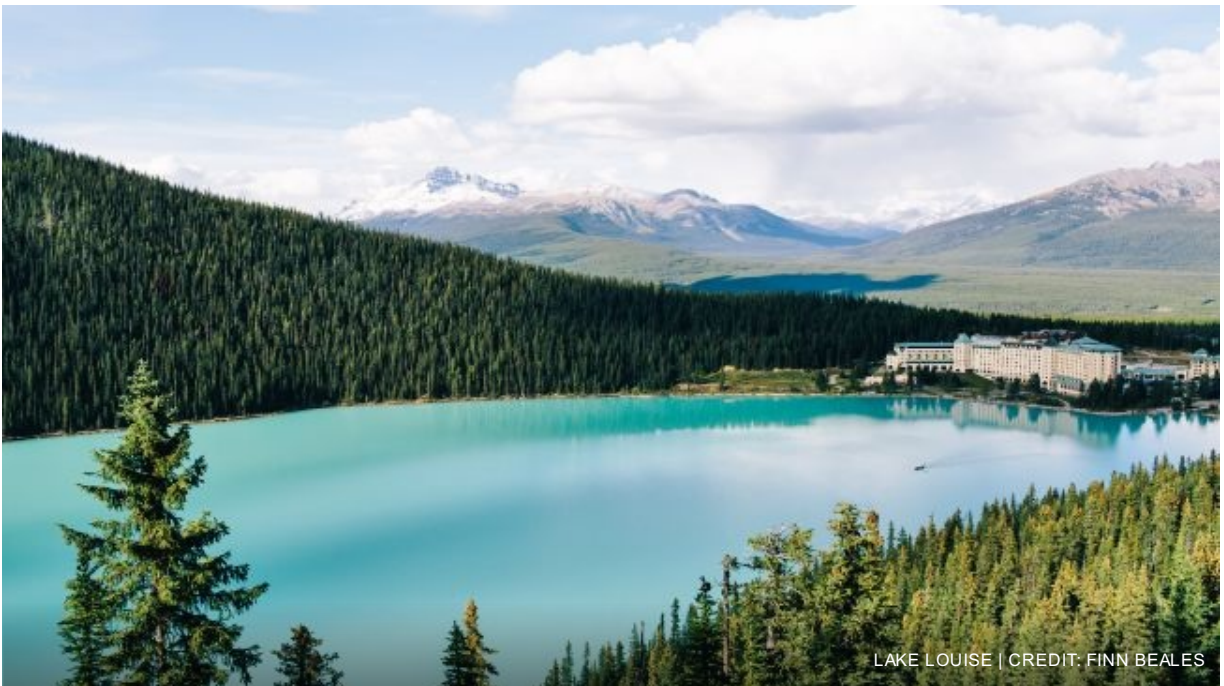
LAKE LOUISE

Overnight in Lake Louise at The Fairmont Chateau Lake Louise