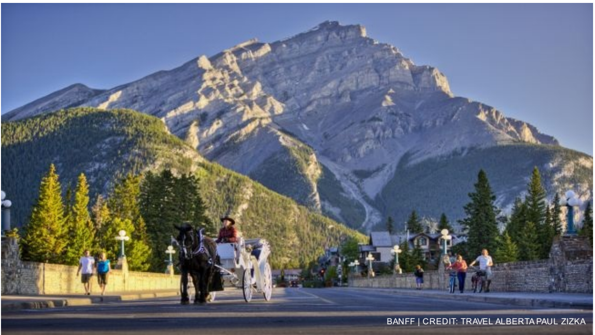
BANFF