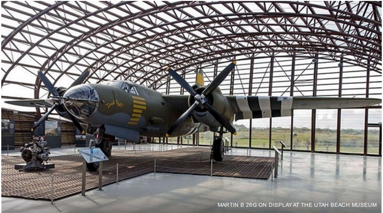
MARTIN B 26G ON DISPLAY AT THE UTAH BEACH MUSEUM