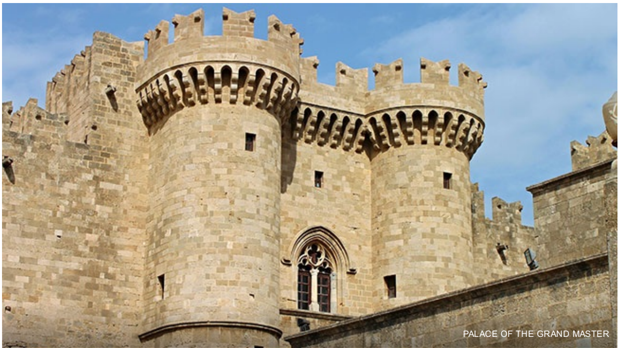
PALACE OF THE GRAND MASTER