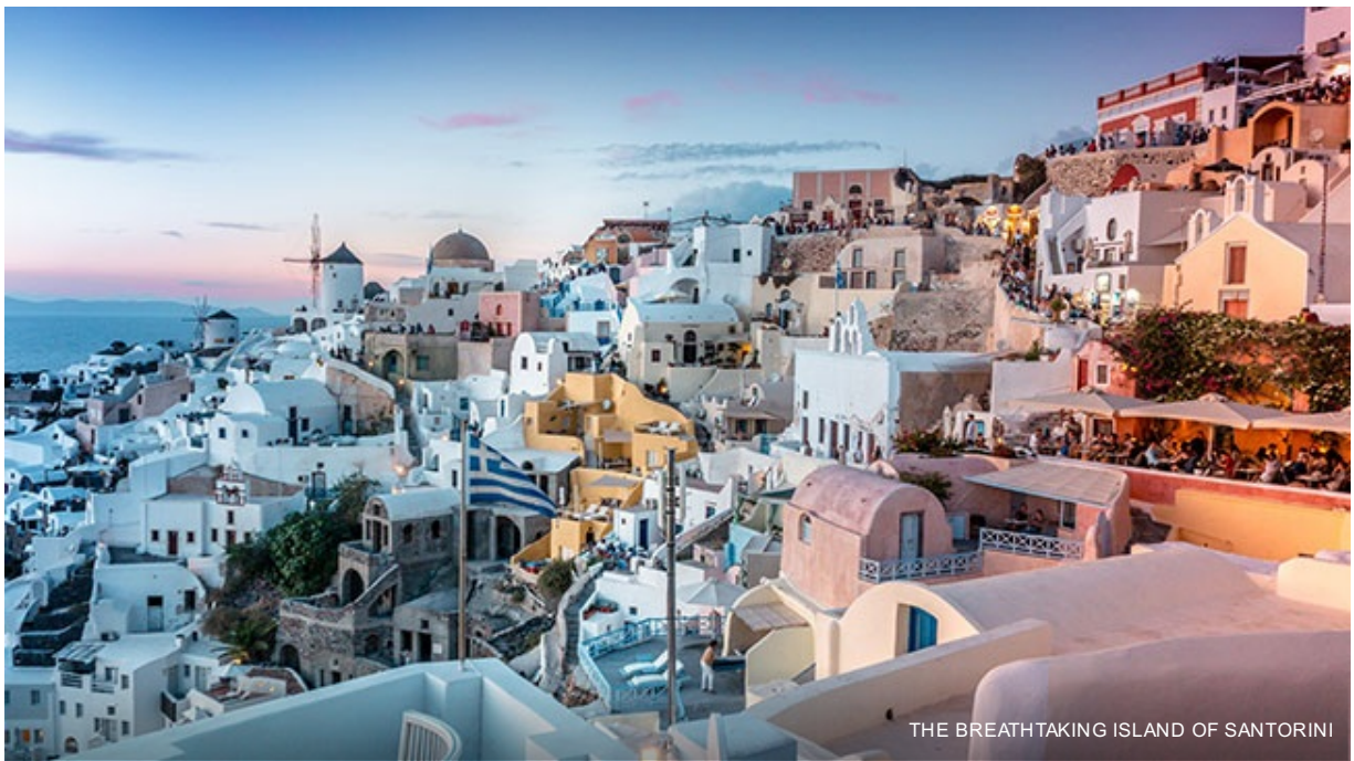
THE BREATHTAKING ISLAND OF SANTORINI