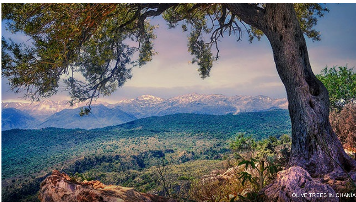
OLIVE TREES IN CHANIA