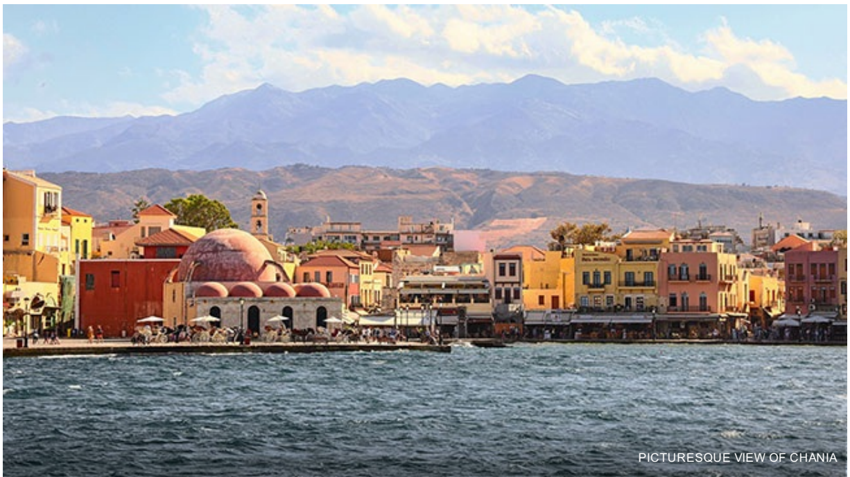
PICTURESQUE VIEW OF CHANIA