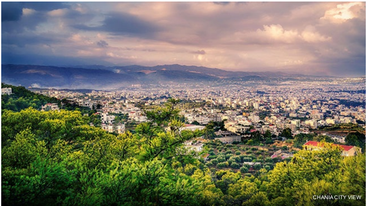
CHANIA CITY VIEW