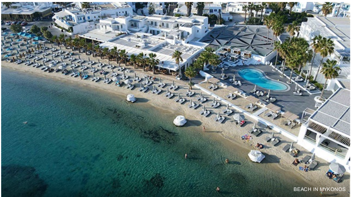
BEACH IN MYKONOS