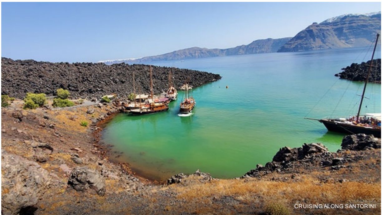
CRUISING ALONG SANTORINI