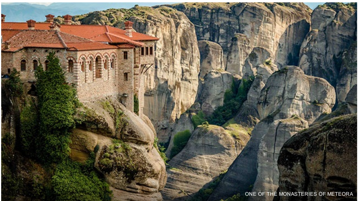
ONE OF THE MONASTERIES OF METEORA