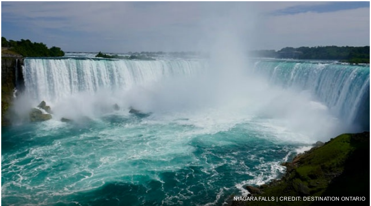
NIAGARA FALLS