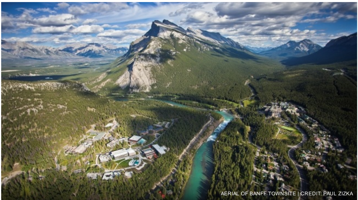
AERIAL OF BANFF TOWNSITE

Experience the best of Rocky Mountain National Parks' backcountry with our curated hiking tours. Revel in spring's wildflowers, summer's clear glacier views, and the golden hues of fall's larch trees. Our passionate local guides will lead you on classic hikes in the Banff and Lake Louise area, including Stanley Glacier, Larch Valley, Kootenay National Park Trails, and Plain of 6 Glaciers. Immerse yourself in nature's beauty across seasons in the Rockies.