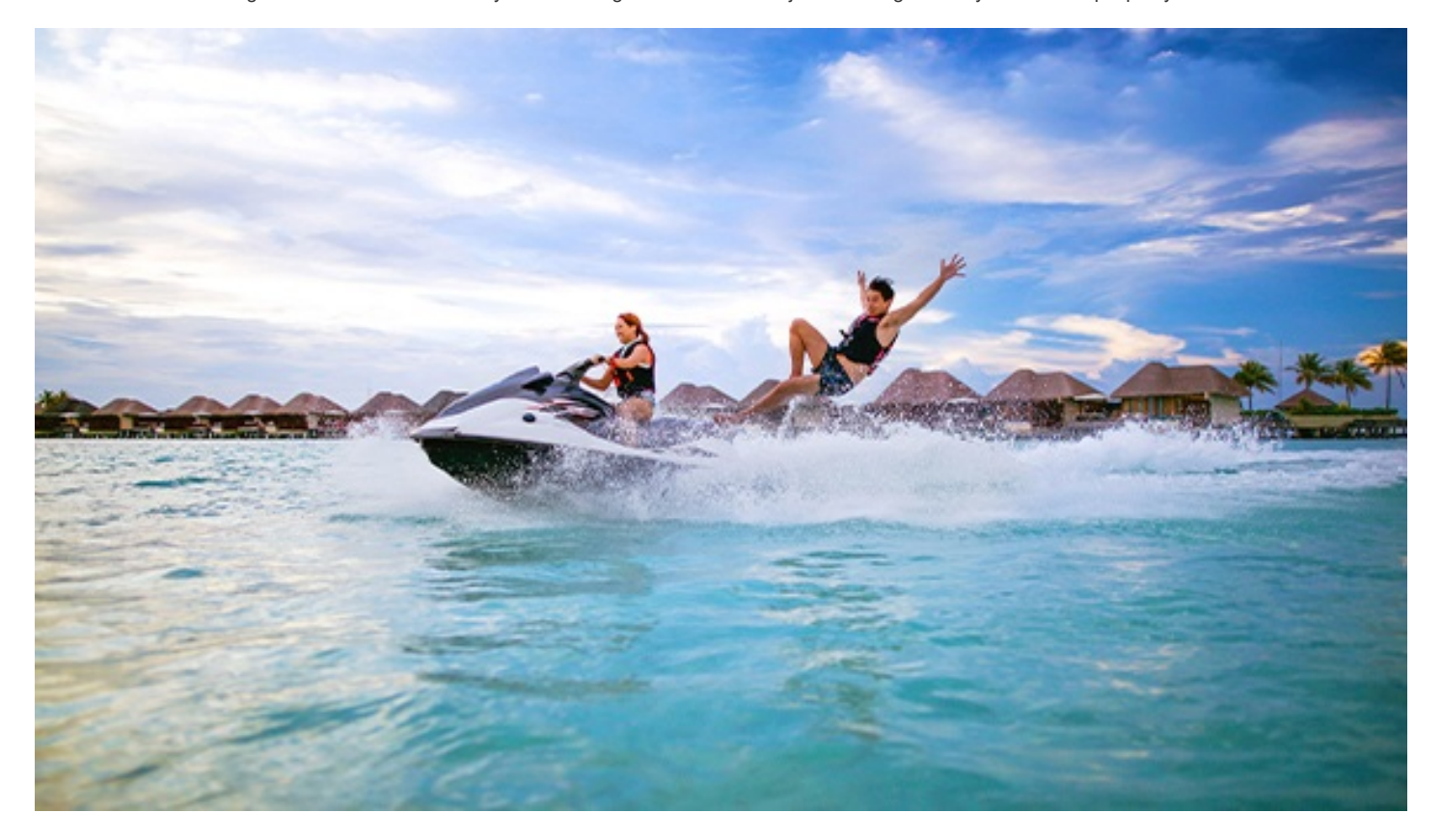
Prices are dynamic based on travel dates. Please proceed to Book Now or Contact Us for details.

Have a fast and thrilling ride. Discover the nearby surroundings on a 30-minute jet ski ride guided by one of the property's instructors.