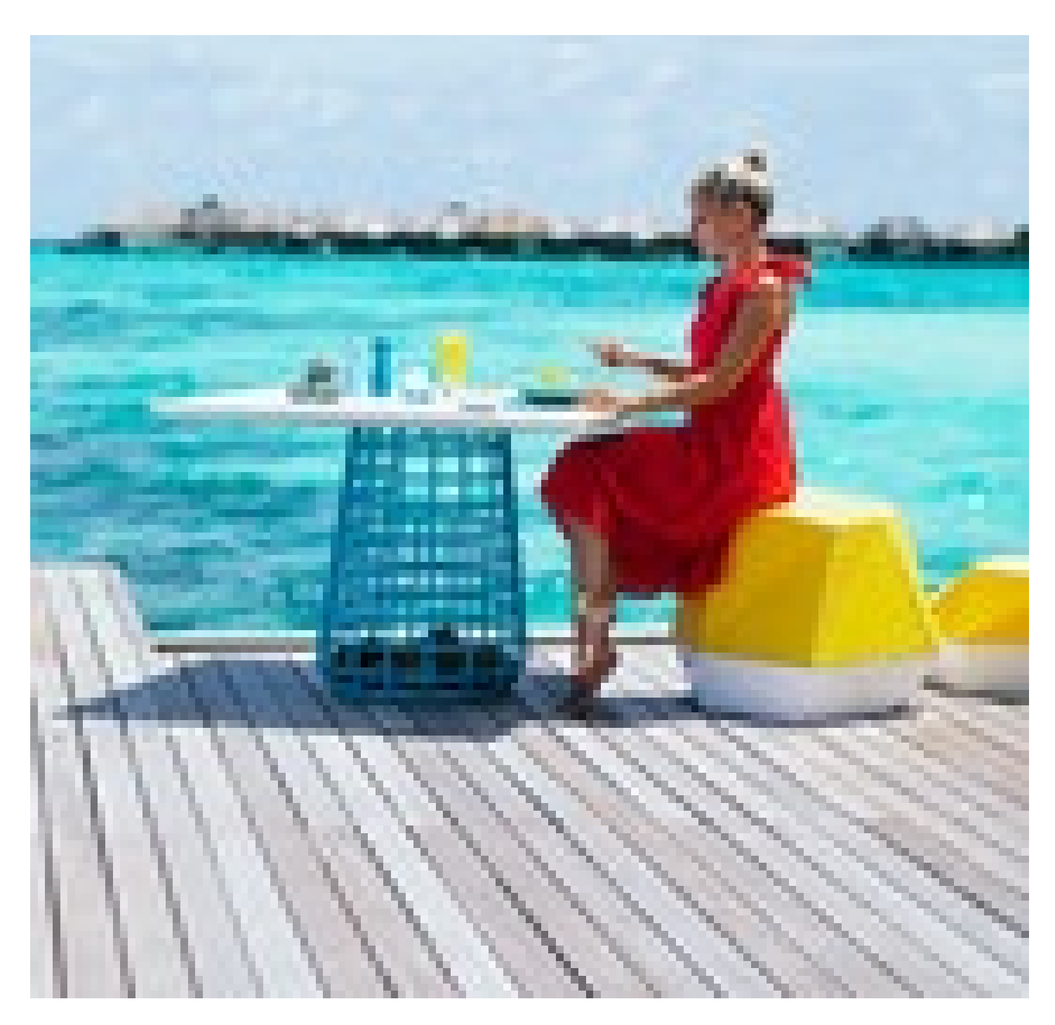
Prices are dynamic based on travel dates. Please proceed to Book Now or Contact Us for details.