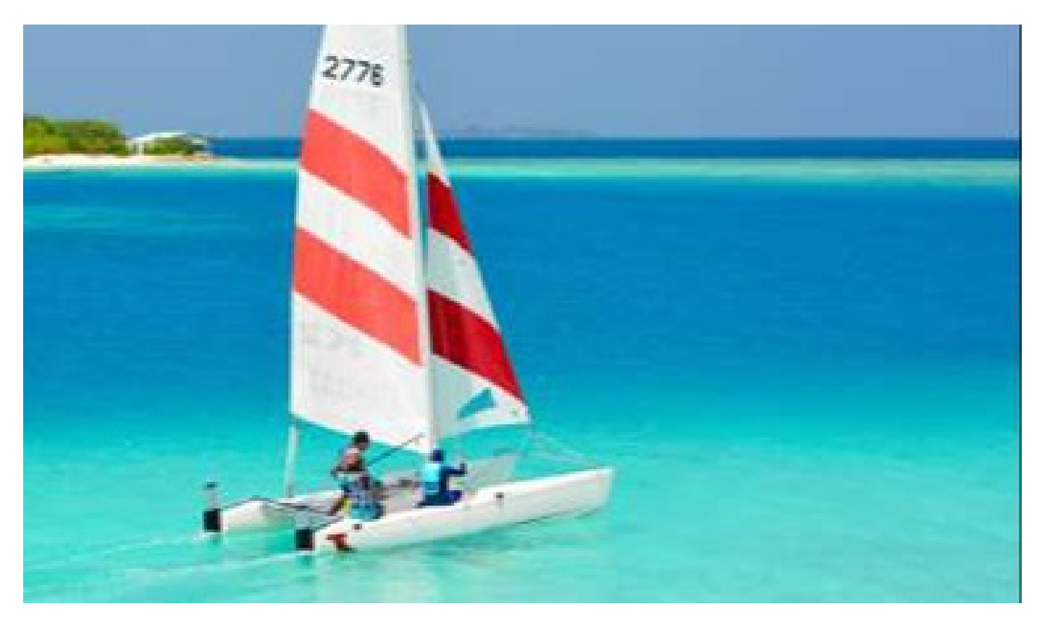
Prices are dynamic based on travel dates. Please proceed to Book Now or Contact Us for details.