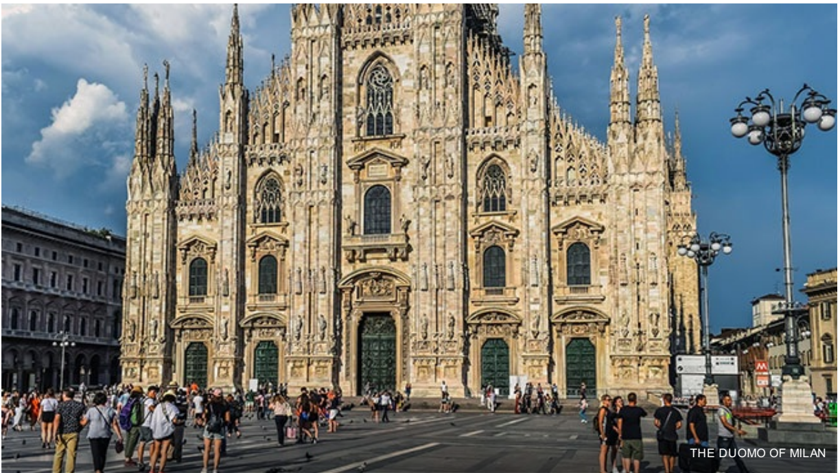
THE DUOMO OF MILAN