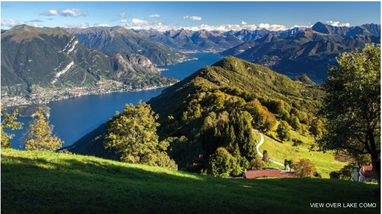
VIEW OVER LAKE COMO