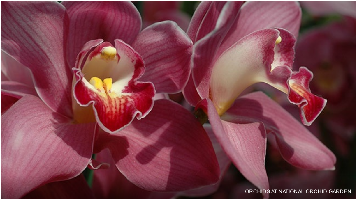
ORCHIDS AT NATIONAL ORCHID GARDEN