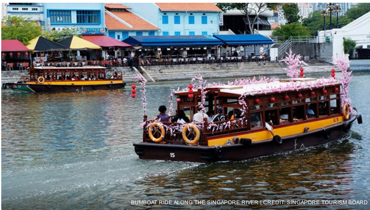
BUMBOAT RIDE ALONG THE SINGAPORE RIVER